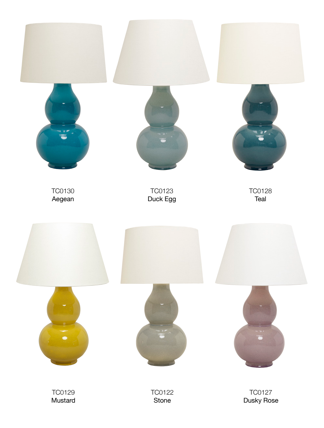
Lampshades shown with options of 18" Pembroke and 17" Warwick drums in lily linen.