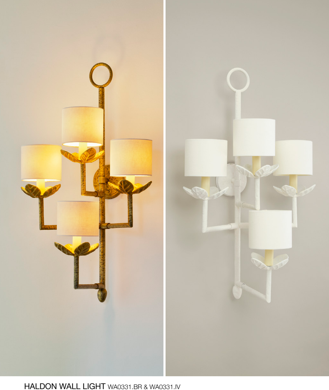
HALDON WALL LIGHT WA0331.BR & WA0331.IV WYKEHAM WALL LIGHT WA0330.BR & WA0330.IV (shown opposite)

The Haldon and the Wykeham Wall Lights are inspired by a French 20th Century antique. These wall lights feature distinctive sculpted leaves and are available with four or eight lights. The randomly pitted metalwork adds texture to this characterful, contemporary piece. Available in brass or a white painted finish and shown with and without 5" Drum lampshades in lily linen.