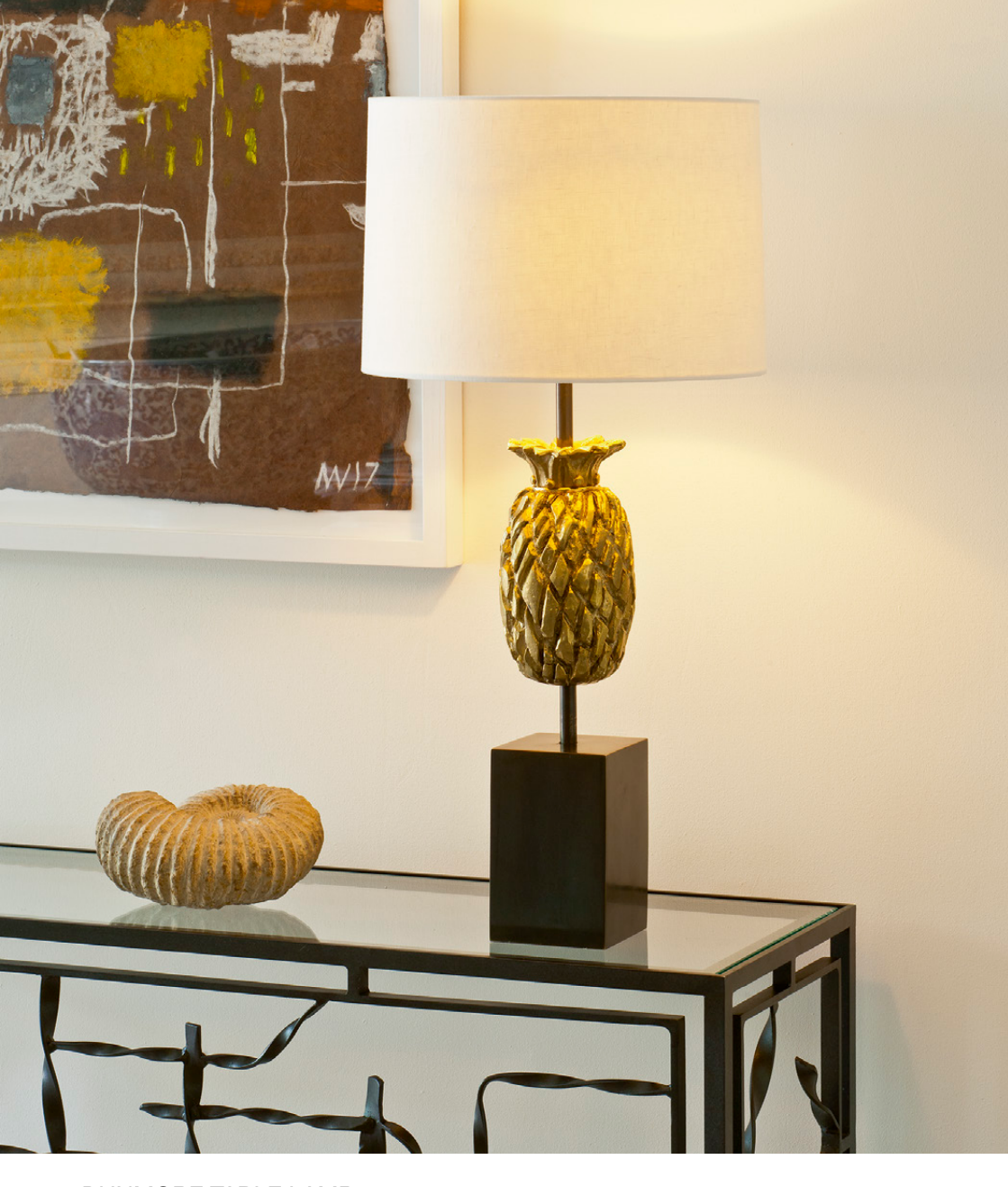
DUNMORE TABLE LAMP TM0097.BR

The Dunmore Table Lamp is a stylish table lamp based on a pineapple. Specialist craftsmen use the art of lost wax casting to individually mould the decorative details of this table lamp in cast brass with a bronzed base. Shown with 12" Warwick lampshade in lily linen.