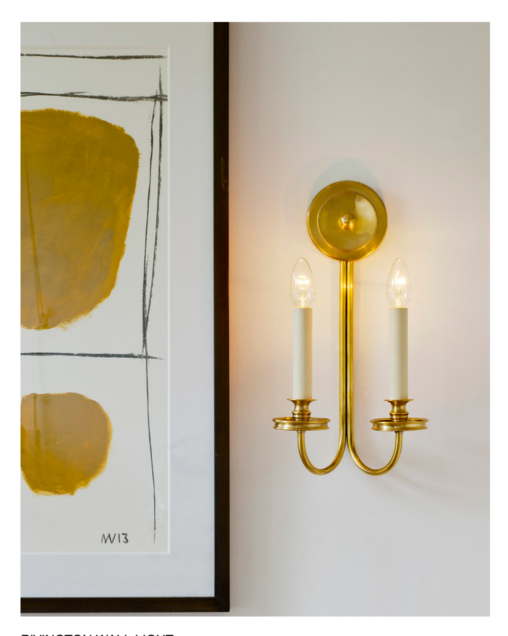
RIVINGTON WALL LIGHT WA316.BR

Based on an original antique from the 1940s, the Rivington Wall Light is finished with beaded detailing on the cups and plate. The product has an attractive elongated form and is made from solid brass.