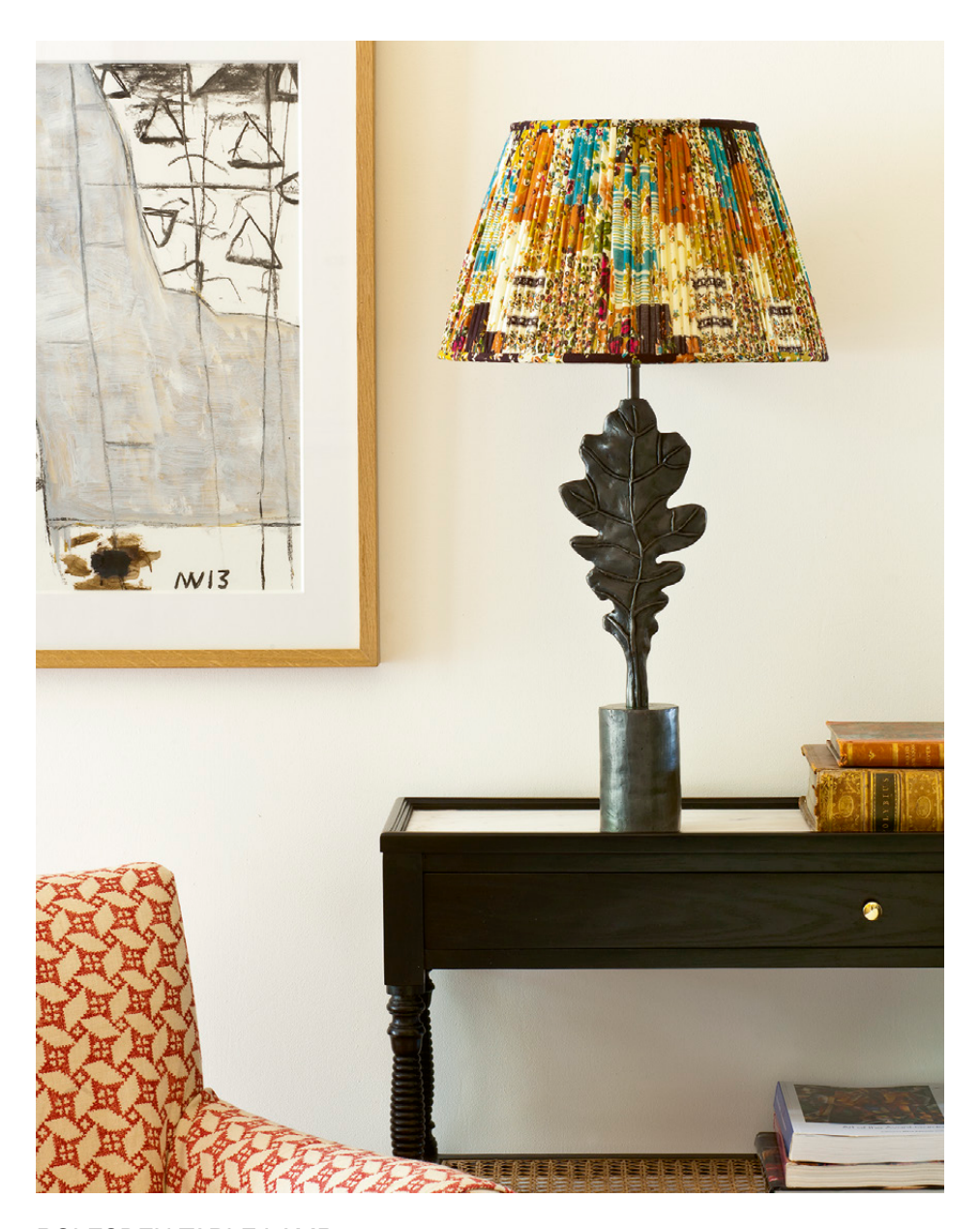
POLESDEN TABLE LAMP TM0099.BZ & TM0099.BR

Inspired by nature, the Polesden Table Lamp centres around a stylized oak leaf. Made using the lost wax casting technique, it is available in both bronze and brass. Shown with 16" Pembroke Rebecca Tribal lampshade.