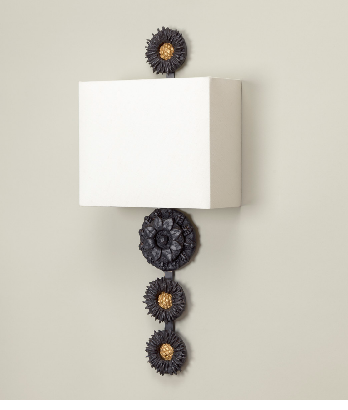
BURNHAM WALL LIGHT WA0336.BZ & WA0336.BR

Similar to the Farnworth Wall Light, with its natural forms, the Burnham Wall Light is textured and decorative with its metal detailing. Made by lost wax casting, it is available in brass or a bronze and brass finish. Shown with Box lampshade in lily linen.