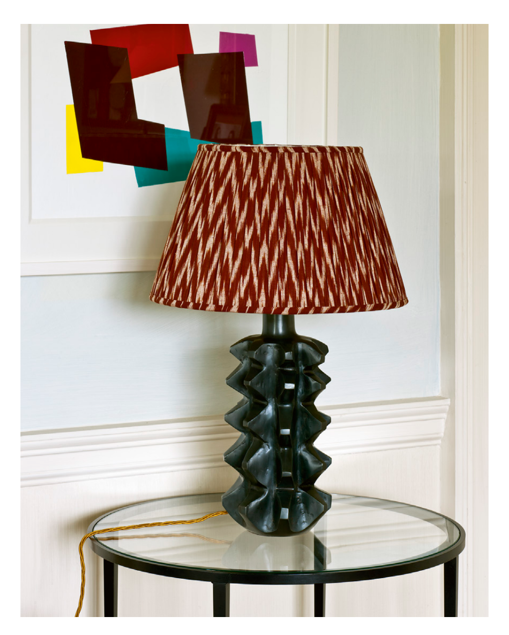
MONMOUTH TABLE LAMP TM0098.BZ & TM0098.BR

The Monmouth Table Lamp is made using the lost wax casting technique. It comes in both bronze and brass finishes and has a strong, abstract feel. Shown with 16" Pembroke Simon Tribal lampshade.