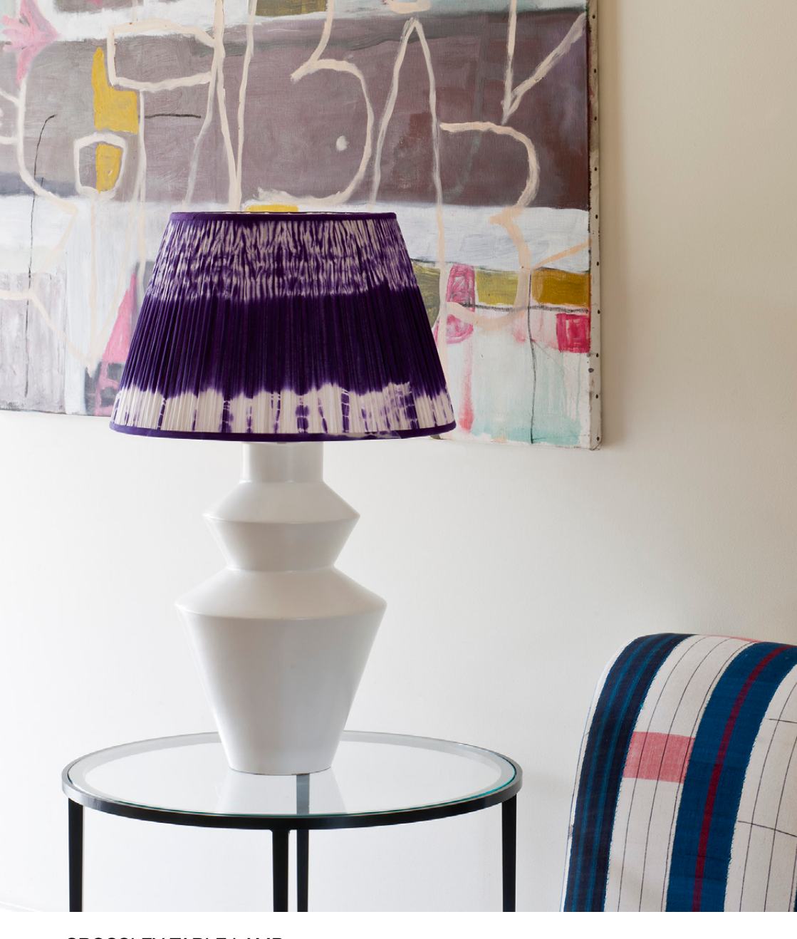
CROSSLEY TABLE LAMP TC0121

Clean, pared-down lines form the basis of the Crossley Table Lamp design. Inspired by 20th century art, it is large in size and slip cast in earthenware and finished with a white satin glaze. Shown with 18" Pembroke Courtney Tribal lampshade.