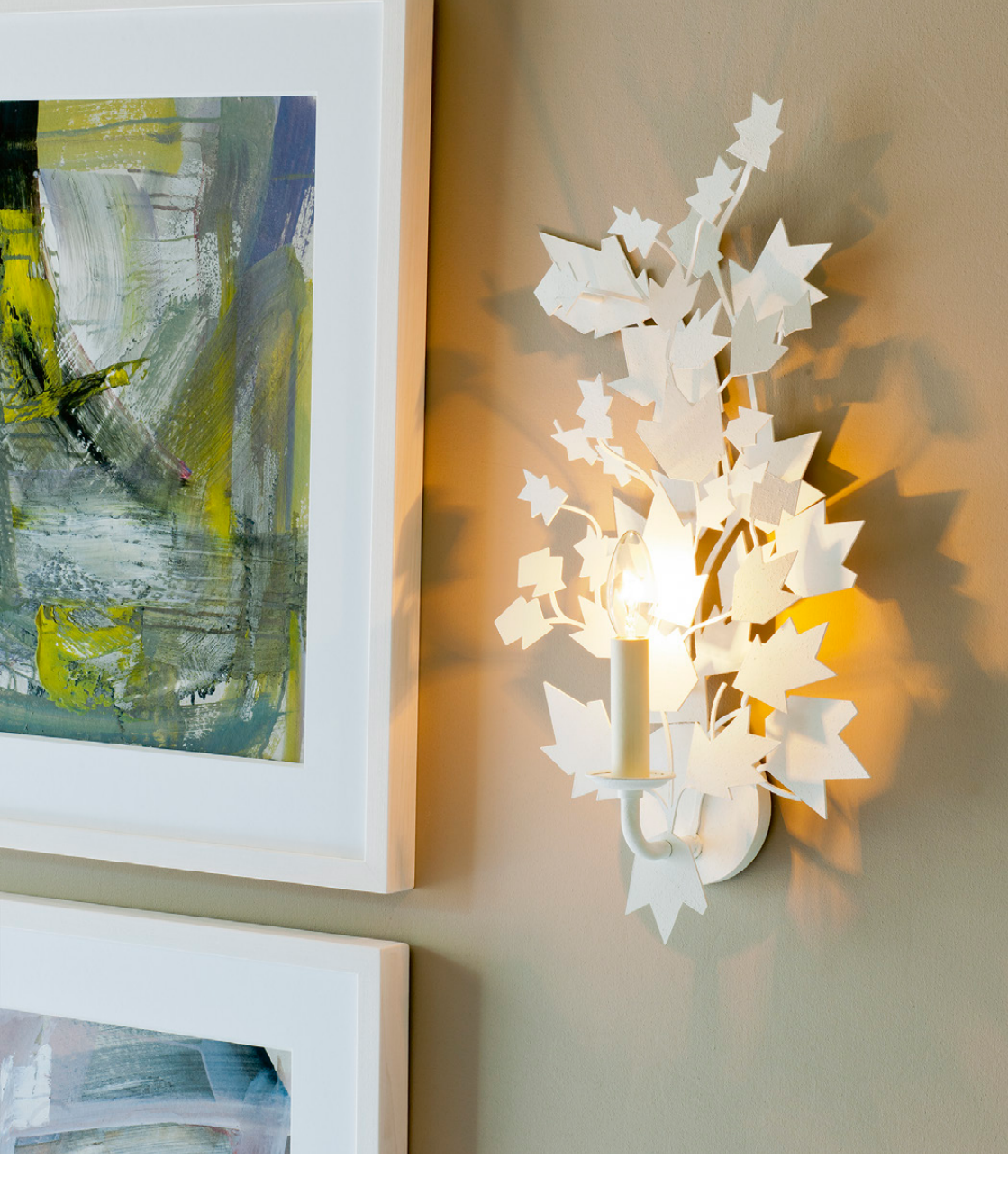
ARDEN WALL LIGHT WA0325.IV

The Arden Wall Light is based on a foliate design. In an ivory white painted finish, this wall light has an attractive, abstract quality. It is made from individually laser-cut metal leaves that are hand decorated with a textured finish and mounted on a painted back plate.