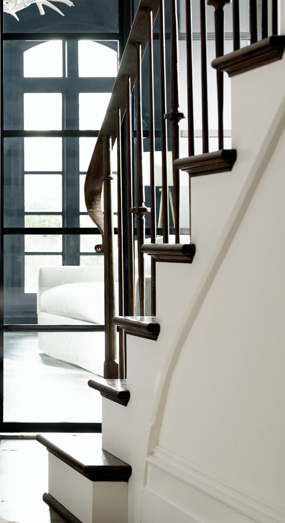
SHOWN: 304-032B Bachelor's Chest