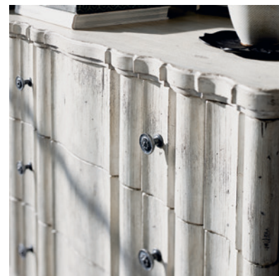
SHOWN: 304-032 Bachelor's Chest 304-125 Round Side Table N2062L Pascal Chairs ( Leather 209-000 )