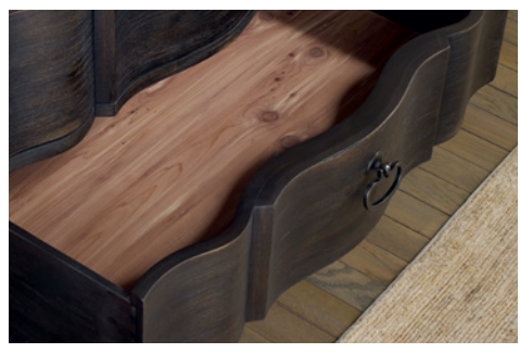
Detail of cedar-lined bottom drawer