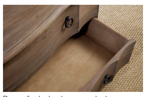
Drawer finished on bottom and sides