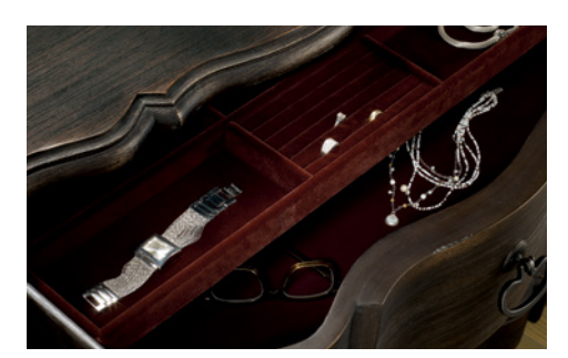
Detail of felt lined drawer