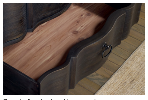
Detail of cedar-lined bottom drawer