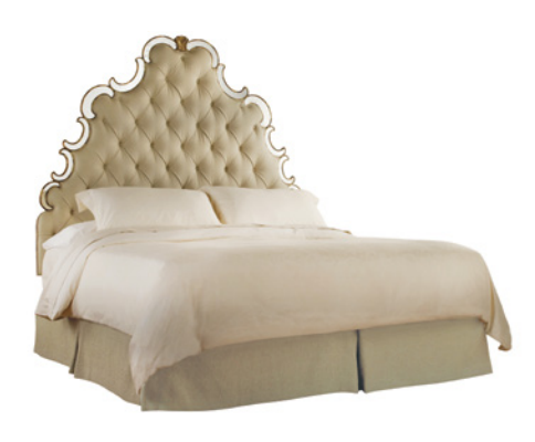
Shown here as HEADBOARD ONLY

3016-90851 Tufted Headboard 5/0 Queen 64W x 4D x 83H (163 x 10 x 211 cm)