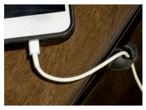
A convenient cord clip avoids one of life's little headaches by holding phone charging cords securely in place so they don't fall behind the nightstand.