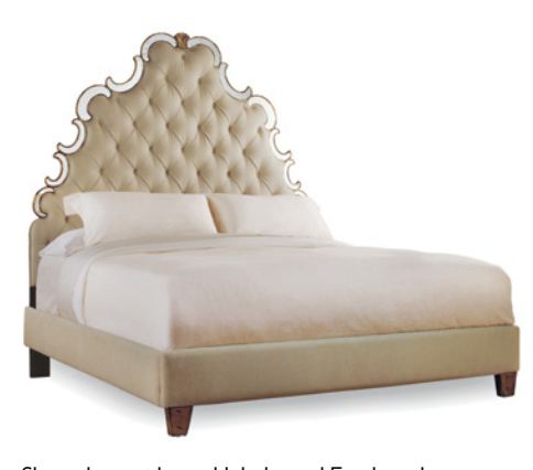
Shown here with 968 Upholstered Footboard & Rails 6/6 King,

3016-90866 Tufted Headboard 6/0-6/6 80 1/2W x 5D x 83H (204 x 13 x 211 cm)