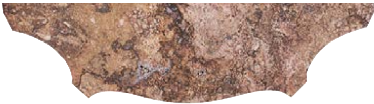
Marble Top Detail