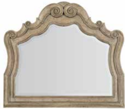
5878-90008-80 Mirror 50W x 2 1/2D x 43 3/4H

For more information on Castella items please see index on page 14.