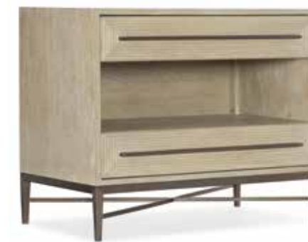
6120-90016-80 Two-Drawer Nightstand 34W x 20D x 28 1/2H