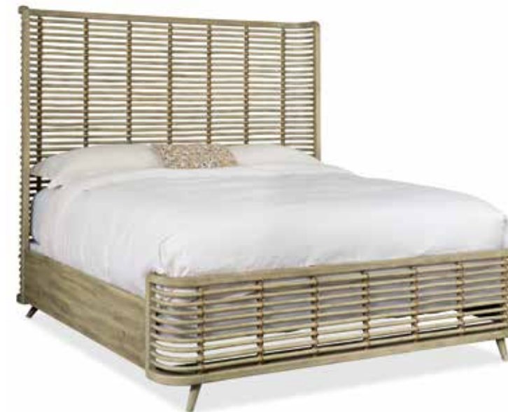
Rattan Bed Pecan Veneers, Cane, Rope, Cliffside finish