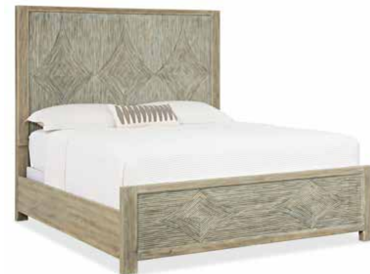
Panel Bed Pecan Veneers, Resin; Cliffside finish

Driftwood: a light, natural finish. Distressing includes sandblasting, bleaching, drawknife and wormholes.