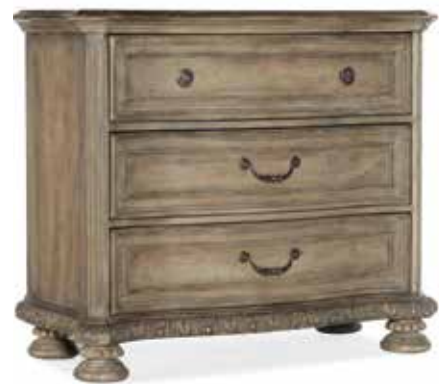
5878-90017-80 Bachelors Chest 42W x 20D x 36 1/4H