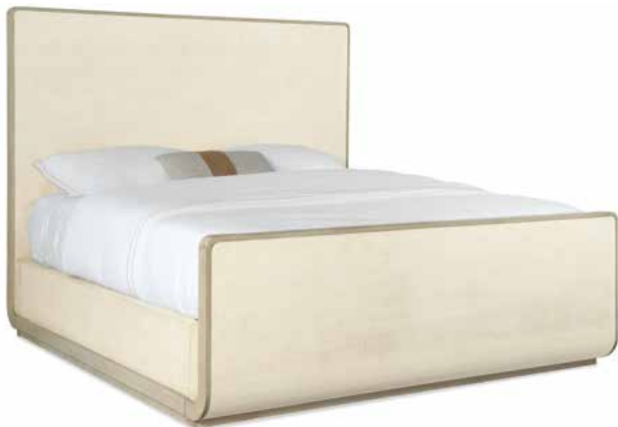
Sleigh Bed White Oak Solids and Burlap; Terrain and Pebble Beach finishes