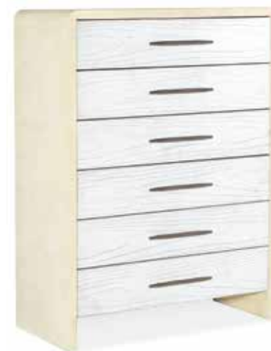
6120-90010-05 Six-Drawer Chest 40W x 19D x 54H