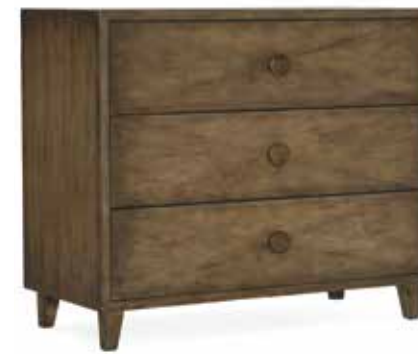
6015-90017-89 Bachelors Chest 38W x 18D x 32 1/4H