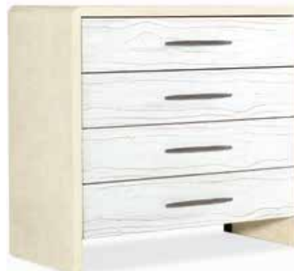
6120-90017-05 Four-Drawer Bachelor Chest 42W x 20D x 38H