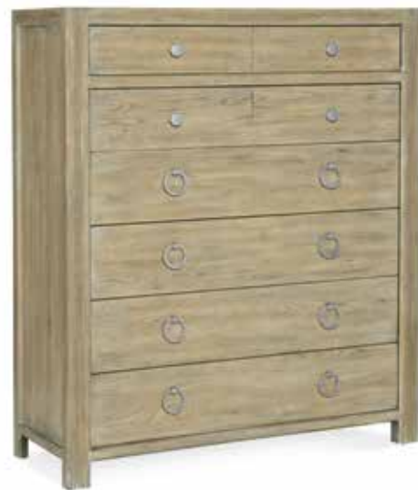
6015-90010-80 Six-Drawer Chest 46W x 19D x 54 1/4H