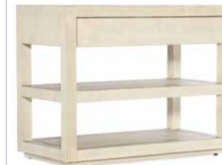
6120-90019-05 One-Drawer Nightstand 36W x 18D x 28H