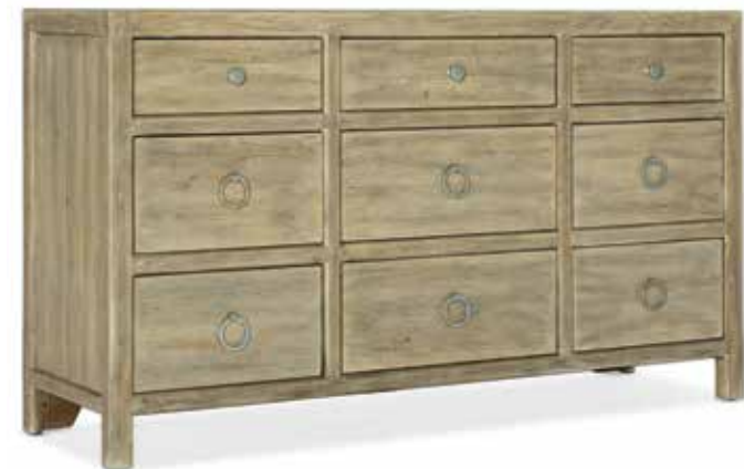
6015-90202-80 Nine-Drawer Dresser 68W x 19D x 38H