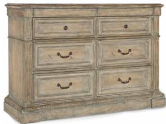
5878-90117-80 Media Chest 60 1/2W x 21 1/2D x 42 1/4H