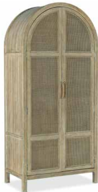
6015-90013-80 Wardrobe 40W x 22D x 86H