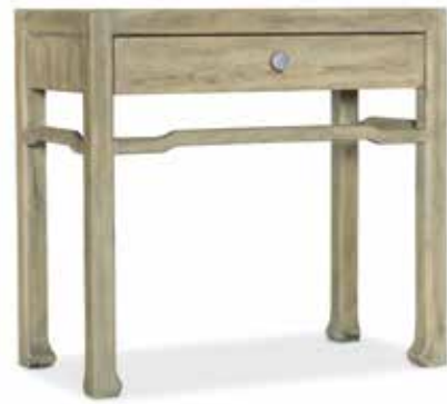
6015-90015-80 One-Drawer Nightstand 32W x 17D x 30 1/4H