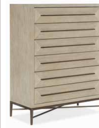
6120-90110-80 Six-Drawer Chest 40W x 19D x 54H