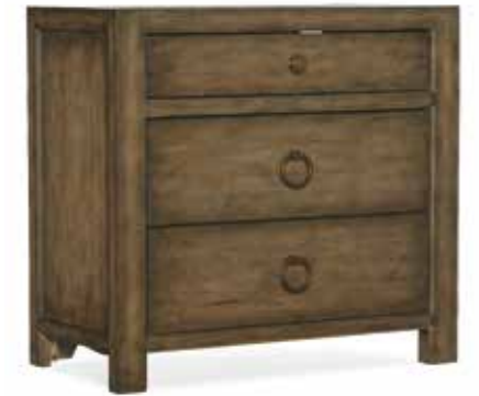
6015-90016-89 Three-Drawer Nightstand 32W x 18D x 30 1/4H