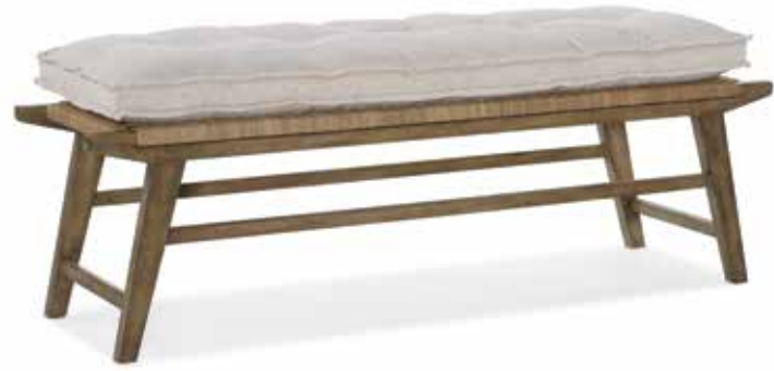
6015-90019-89 Bed Bench 64 1/4W x 18D x 21 1/2H

For more information on Sundance items please see index on page 15.