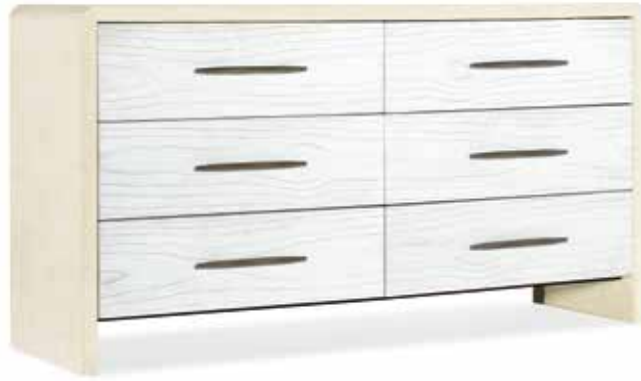
6120-90002-05 Six-Drawer Dresser 65W x 20D x 34 3/4H

For more information on Cascade items please see index on page 14.