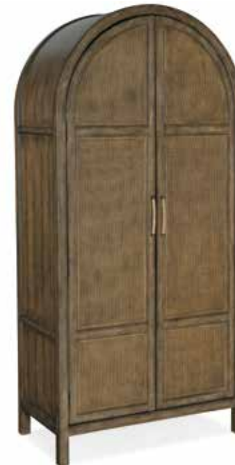
6015-90013-89 Wardrobe 40W x 22D x 86H