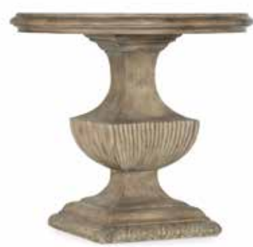
5878-90015-80 Urn Pedestal Nightstand 31Dia. x 28H