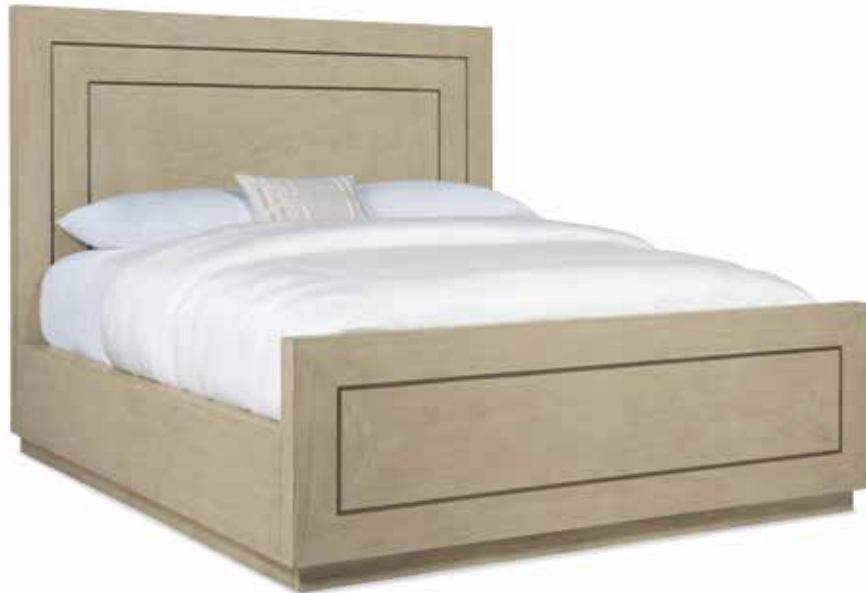
Panel Bed Oak Veneers and Metal Inlay; Terrain finish; Metal inlay on headboard and footboard