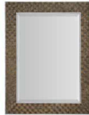
6015-90004-89 Portrait Mirror 36 3/4W x 11/4D x 48H

For more information on Sundance items please see index on page 15.