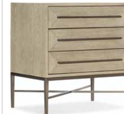
6120-90115-80 Three-Drawer Nightstand 26W x 18D x 28H