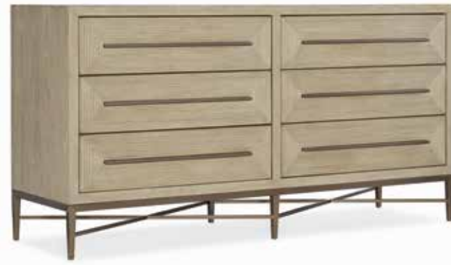
6120-90202-80 Six-Drawer Dresser 66 1/2W x 20D x 33 1/2H