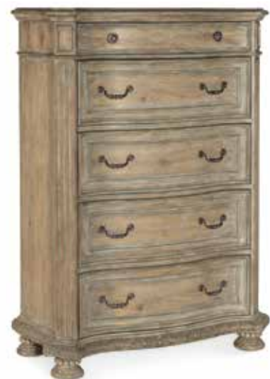
5878-90010-80 Five Drawer Chest 43W x 20D x 60 1/2H