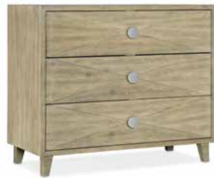
6015-90017-80 Bachelors Chest 38W x 18D x 32 1/4H

For a full line of bedroom items visit our website: hookerfurniture.com