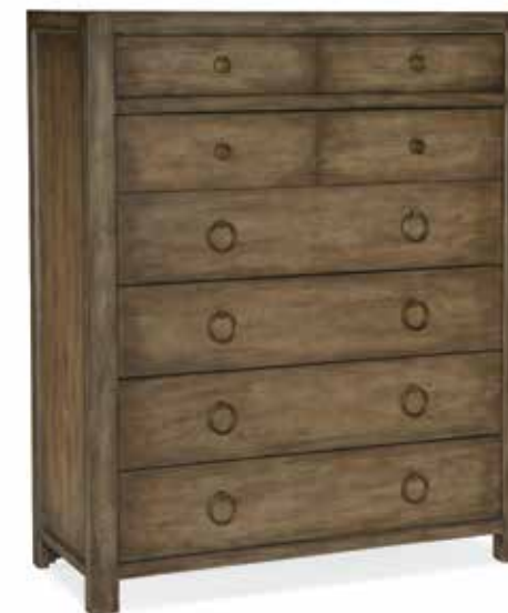
6015-90010-89 Six-Drawer Chest 46W x 19D x 54 1/4H