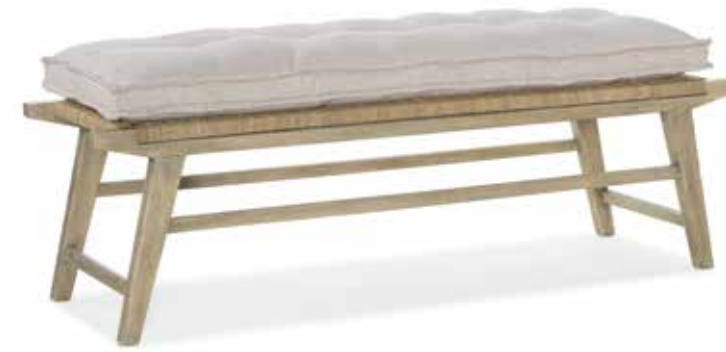
6015-90019-80 Bed Bench 64 1/4W x 18D x 21 1/2H

For a full line of bedroom items visit our website: hookerfurniture.com