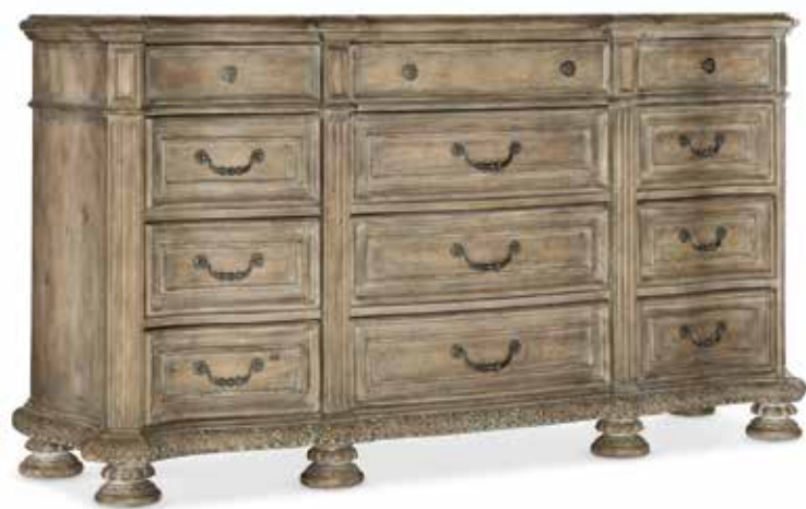
5878-90002-80 Twelve Drawer Dresser 73W x 22D x 40 1/2H