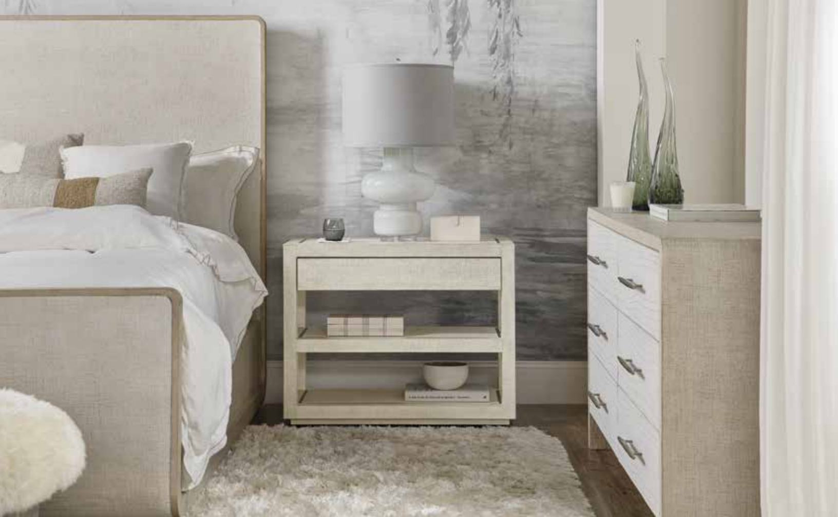
6120-90466-05 King Sleigh Bed 85 1/2W x 89D x 65H