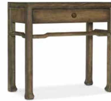
6015-90015-89 One-Drawer Nightstand 32W x 17D x 30 1/4H