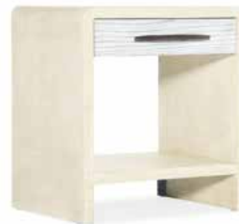
6120-90015-05 One-Drawer Nightstand 26W x 19D x 28H

For more information on Cascade items please see index on page 14.