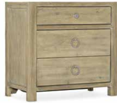
6015-90016-80 Three-Drawer Nightstand 32W x 18D x 30 1/4H