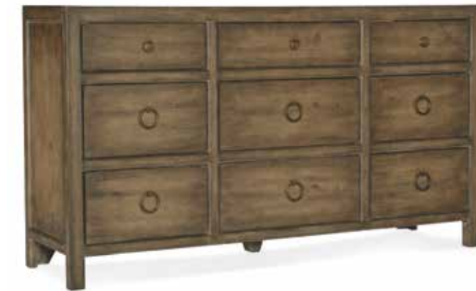
6015-90202-89 Nine-Drawer Dresser 68W x 19D x 38H