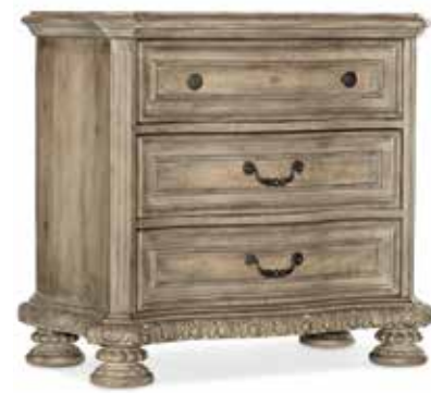
5878-90016-80 Three Drawer Nightstand 34 1/2W x 20 1/4D x 32 1/4H