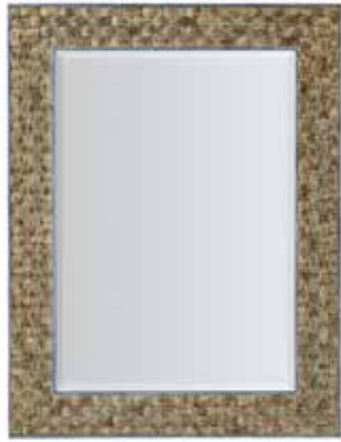
6015-90004-85 Portrait Mirror 36 3/4W x 11 1/4D x 48H