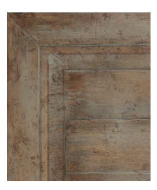
A naked bleached patina in a parchment color emulates a serene, natural wood tone.