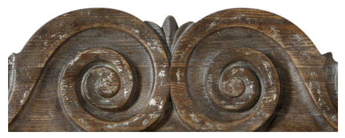
Reminiscent of an old world European antique, this soft timeworn finish with silver leaf accent lends itself to several Rhapsody items, creating a well-traveled look at home.