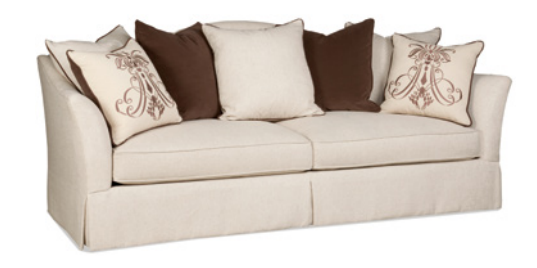
Style No. 7012-001 Body fabric: 2239 Linen (3) Back Pillows: 2239 Linen with 8389 Latte Welt

(2) Back Pillows: 8389 Latte 1/2 of (2) Toss Pillows: Zitella Brown 1/2 of (2) Toss Pillows and welt: 8389 Latte shown on page 18