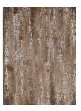
Inspired by today's casual living, this finish has a rustic raw wood look that suggests the feeling of an antique barn door.