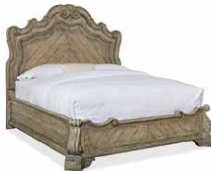
Panel Bed Pecan, Quartered Walnut, Quartered Black Walnut, Maple and Ash Veneers; Antique Slate finish