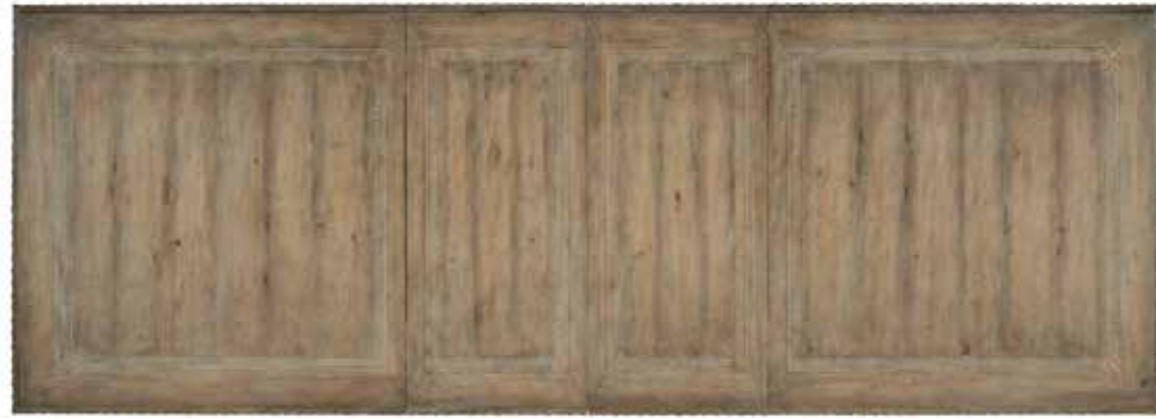
Top View of 5878-75207-80 Rectangle Dining Table with two 20-Inch Leaves