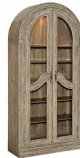
5878-50001-80 Bunching Curio Pecan, Quartered Walnut, Quartered Black Walnut, Quartered Ash and Maple Veneers Antique Slate finish; Two doors with seeded glass, four adjustable shelves, top two shelves are adjustable wood-framed glass with plate grooves, center shelf is fixed, bottom two wood shelves are adjustable, light with three-intensity touch switch, levelers, anti-tip hardware 44W x 16 1/4D x 90 1/2H (112 x 42 x 230 cm) shown on page: 2, 3