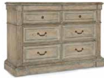
5878-90117-80 Media Chest Pecan, Quartered Hickory, Quartered Black Walnut, Quartered Ash, Maple and Birch Veneers with Cedar, Jewelry Tray and Solid-Wood Edge Top; Antique Slate finish; Eight drawers, top two drawers are felt-lined with jewelry storage, second row of drawers have drop-fronts for media storage, bottom drawer have cedar-lined bottoms, levelers, anti-tip hardware 60 1/2W x 21 1/2D x 42 1/4H (154 x 55 x 108 cm) shown on page: 9