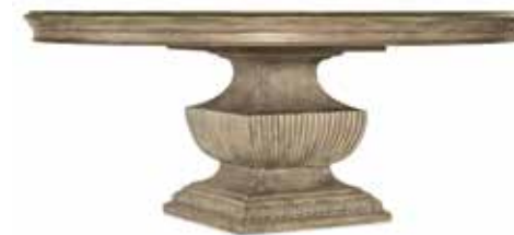
5878-75213-80 72-Inch Round Urn Table Pecan, Quartered Hickory, Quartered Black Walnut, Quartered Ash and Maple Veneers with Resin; Antique Slate finish; Will seat up to 8 guests, levelers 72Dia. x 30H (183 x 77 cm) shown on page: 5