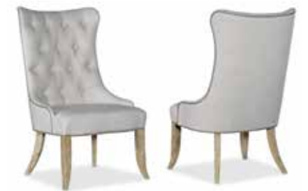
5878-75511-80 Tufted Dining Chair Fabric: Natural Tan (Performance) and Nailheads; Antique Slate finish 26 3/4W x 30 3/4D x 45 1/2H (68 x 79 x 116 cm) shown on page: 2, 3, 16