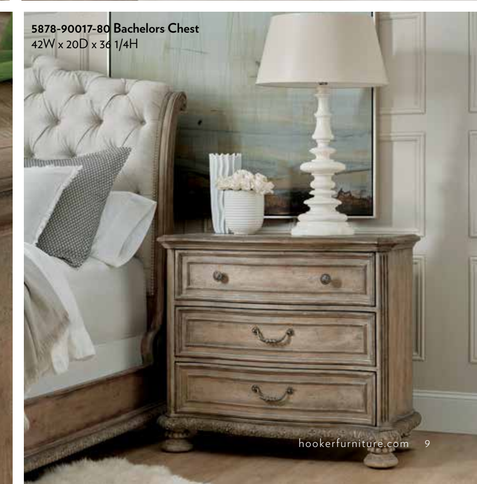
5878-90017-80 Bachelors Chest 42W x 20D x 36 1/4H