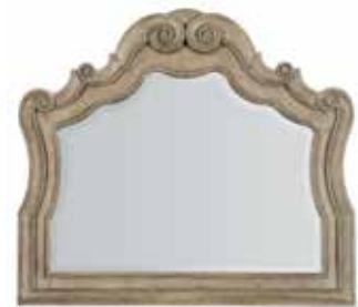
5878-90008-80 Mirror Walnut Veneers with Beveled Mirror Antique Slate finish 50W x 2 1/2D x 43 3/4H (127 x 7 x 112 cm) shown on page: 7, 10