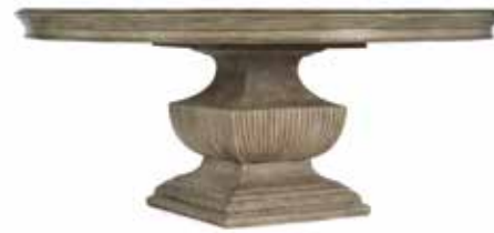
5878-75203-80 60-Inch Round Dining Table Pecan, Quartered Hickory, Quartered Black Walnut, Quartered Ash and Maple Veneers with Resin; Antique Slate finish; levelers Will seat up to 6 guests, 60Dia. x 30H (153 x 77 cm)