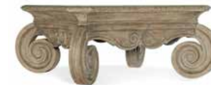
5878-80112-80 Square Cocktail Table Pecan, Quartered Walnut, Quartered Black Walnut, Ash and Maple Veneers; Antique Slate finish, levelers 49 1/4W x 49 1/4D x 22 1/2H (126 x 126 x 58 cm) shown on page: 13