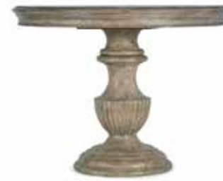
5878-75202-80 Dining/Center Hall Table Pecan, Quartered Hickory, Quartered Black Walnut, Quartered Ash, and Maple Veneers with Resin and Solid Wood-Edge Top; Antique Slate finish; Height adjust to 30-inch dining or 36-inch counter heights, levelers 48Dia. x 30H (122 x 77 cm)