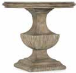
5878-90015-80 Urn Pedestal Nightstand Pecan, Quartered Hickory, Quartered Black Walnut, Quartered Ash and Maple Veneers with Solid-Wood Edge Top Antique Slate finish, levelers 31W x 31D x 28H (79 x 79 x 72 cm)