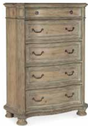
5878-90010-80 Five Drawer Chest Pecan, Quartered Hickory, Quartered Black Walnut, Quartered Ash, Maple and Birch Veneers with Cedar Drawer Bottom, Felt Panel and Solid-Wood Edge Top; Antique Slate finish Five drawers, top drawer has a removable felt liner, bottom drawers have cedar-lined bottom, levelers, anti-tip hardware 43W x 20D x 60 1/2H (110 x 51 x 154 cm) shown on page: 8