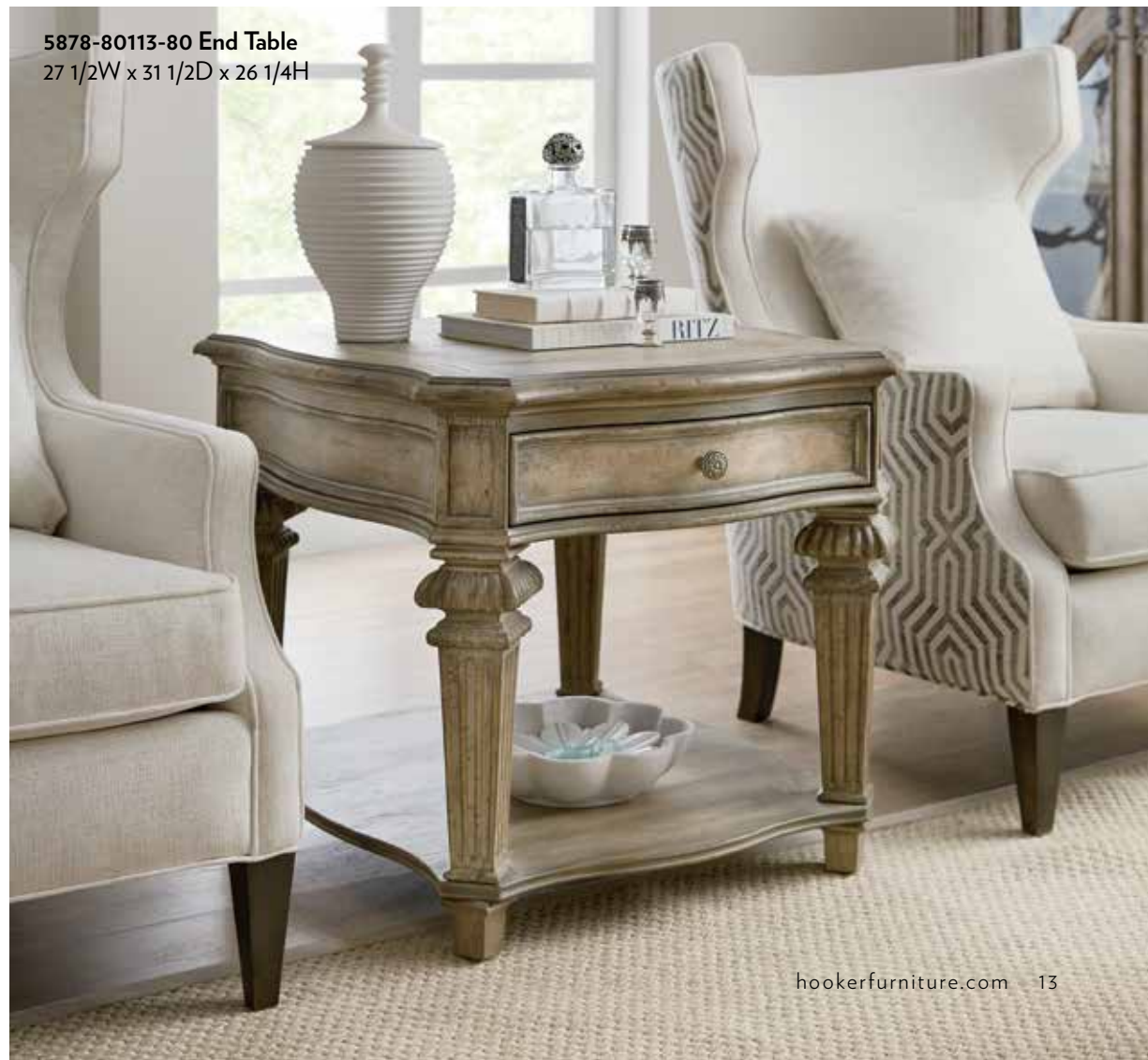
5878-80113-80 End Table 27 1/2W x 31 1/2D x 26 1/4H