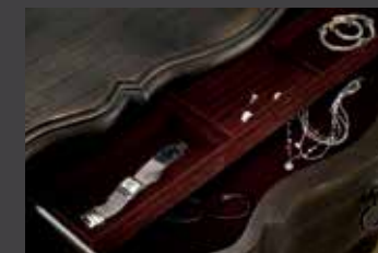
Detail of felt lined drawer