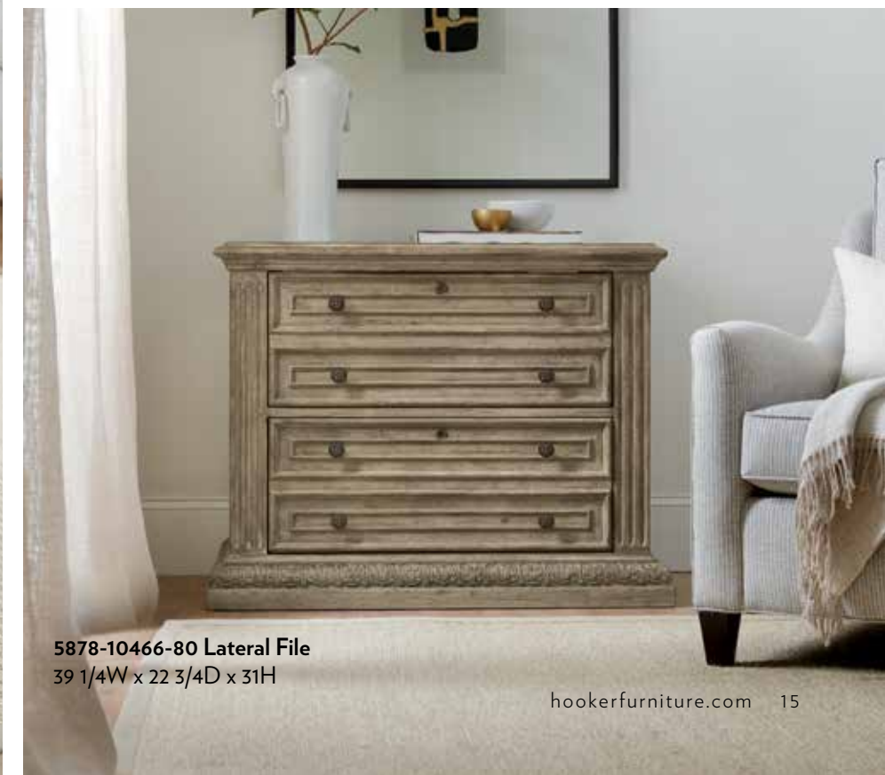
5878-10466-80 Lateral File 39 1/4W x 22 3/4D x 31H