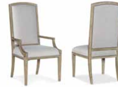
5878-75400-80 Arm Chair Fabric: Natural Tan (Performance) and Nailheads; Antique Slate finish 24W x 25 3/4D x 46H (61 x 66 x 117 cm)