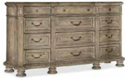
5878-90002-80 Twelve Drawer Dresser Pecan, Quartered Walnut, Quartered Black Walnut, Quartered Ash and Maple Veneers with Cedar Drawer Bottom, Resin and Felt Panel; Antique Slate finish; Twelve drawers, center drawer has drop-front, top three drawers have removable felt liners, three bottom drawers have cedar-lined bottoms, levelers, anti-tip hardware 73W x 22D x 40 1/2H (186 x 56 x 103 cm) shown on page: 7, 10