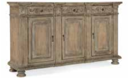
5878-85001-80 72-inch Credenza Quartered Walnut, Quartered Black Walnut, Quartered Ash and Maple Veneers; Antique Slate finish; Three doors, one adjustable wood shelf behind each door, three drawers, levelers, anti-tip hardware 72W x 20D x 42 1/2H (183 x 51 x 108 cm) shown on page: 2, 3, 4