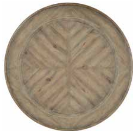
Top View of 5878-75202-80 Dining/Center Hall Table