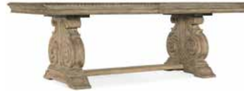
5878-75207-80 Rectangle Dining Table with two 20-Inch Leaves Pecan, Quartered Walnut, Quartered Black Walnut, Quartered Ash and Maple Veneers with Resin; Antique Slate finish; Two 20-inch leaves, table extends to 128-inches long with leaves in place, levelers 88-128W x 46D x 30H (224-325 x 117 x 77 cm) shown on page: 2, 3