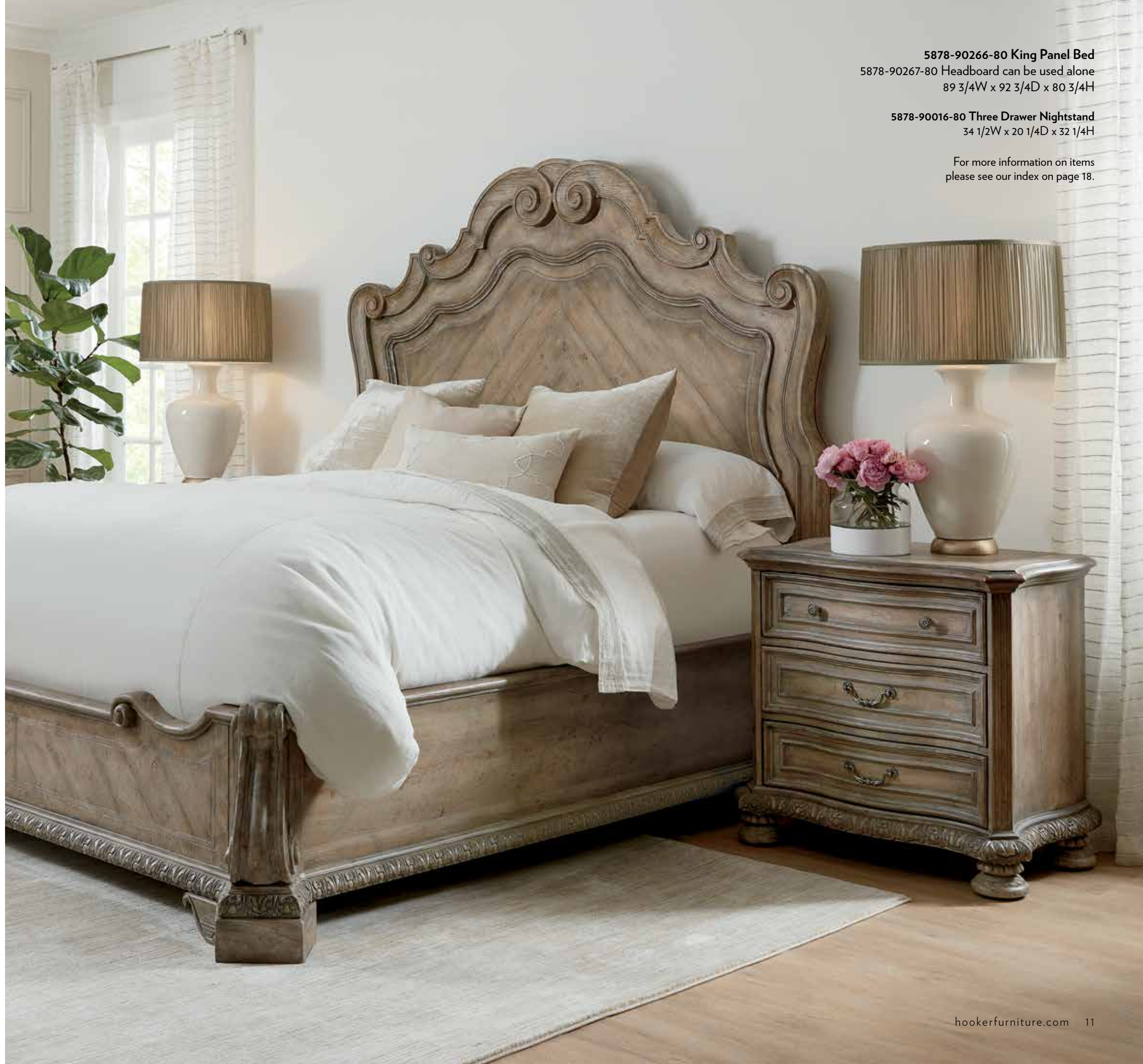
5878-90266-80 King Panel Bed 5878-90267-80 Headboard can be used alone 89 3/4W x 92 3/4D x 80 3/4H