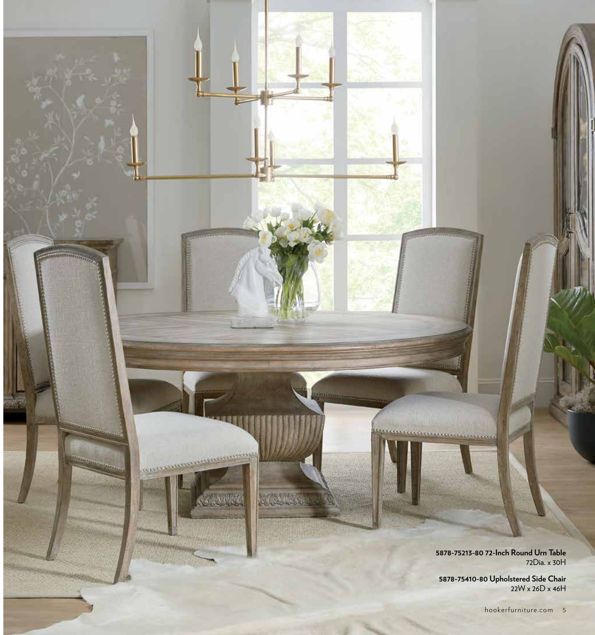
5878-75213-80 72-Inch Round Urn Table 72Dia. x 30H