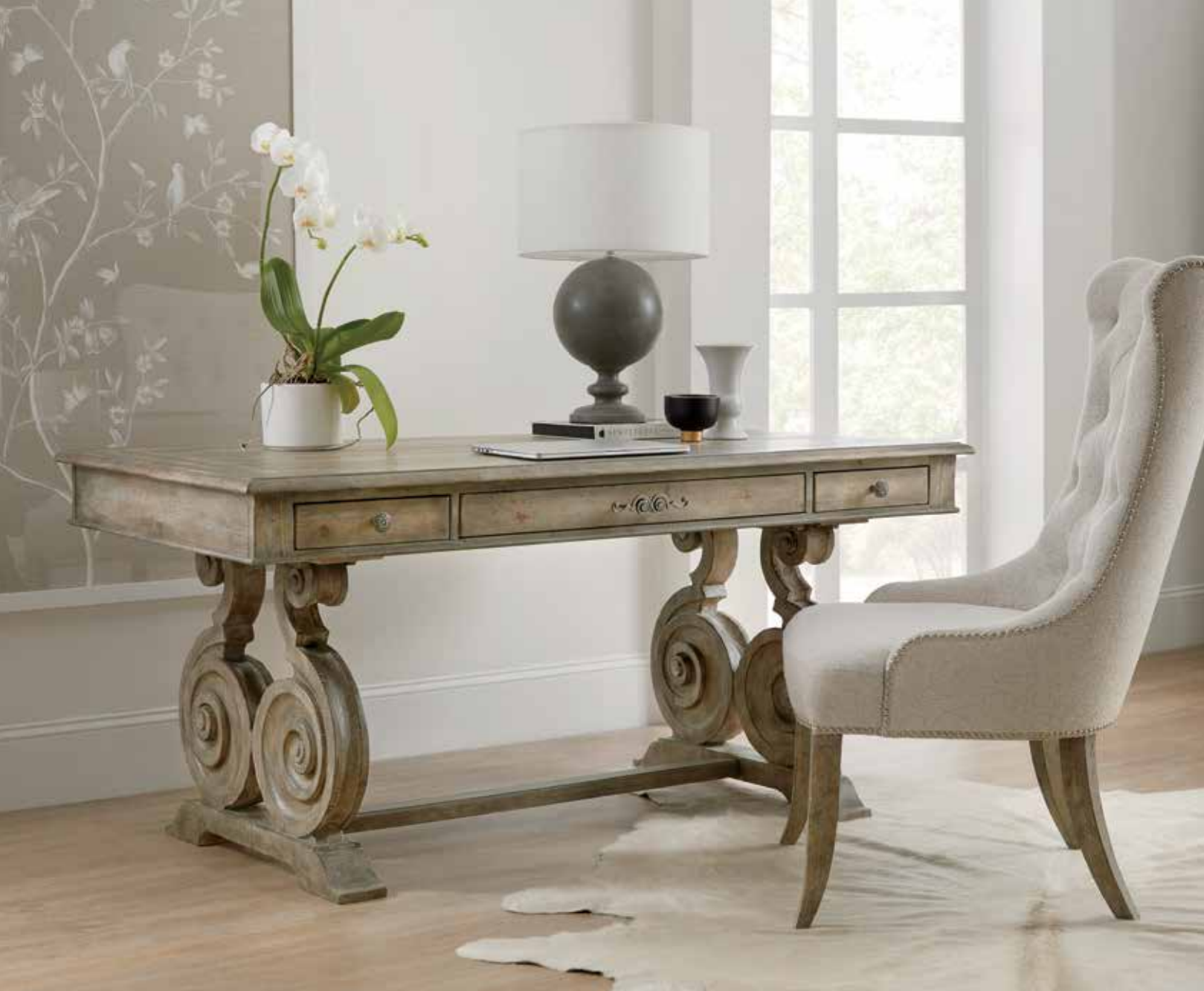
5878-10459-80 Writing Desk 66W x 34D x 31H