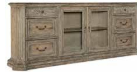
5878-55488-80 Entertainment Console Pecan, Quartered Hickory, Quartered Black Walnut, Quartered Ash and Maple Veneers, Resin, Outlet and Solid-Wood Edge Top; Antique Slate finish; Two wood-framed doors with seeded glass and soft-close hinges, six drawers, one adjustable wood shelf behind pair of doors, ventilated back panel, FC705 one three-plug electrical outlet, levelers 88W x 19D x 36H (224 x 49 x 92 cm) shown on page: 12