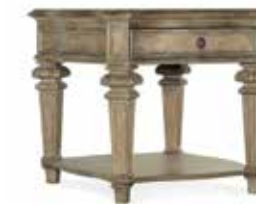
5878-80113-80 End Table Pecan, Quartered Walnut, Quartered Black Walnut, Ash and Maple Veneers; Antique Slate finish; One drawer, one fixed shelf, levelers 27 1/2W x 31 1/2D x 26 1/4H (70 x 81 x 67 cm) shown on page: 13