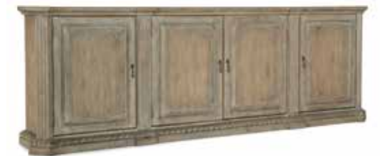
5878-85006-80 Accent Console Pecan, Maple, Black Walnut, Walnut and Ash Veneers with Resin and Solid-Wood Edge Top Antique Slate finish; Four doors, one adjustable shelf behind each outside door, one adjustable shelf behind pair of center doors, levelers, ventilated back panel 105W x 18D x 36H (267 x 46 x 92 cm)