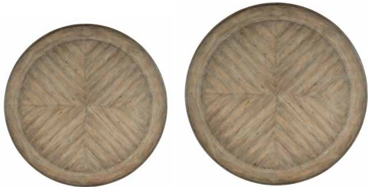
Top View of 5878-75203-80 60-Inch Round Dining Table