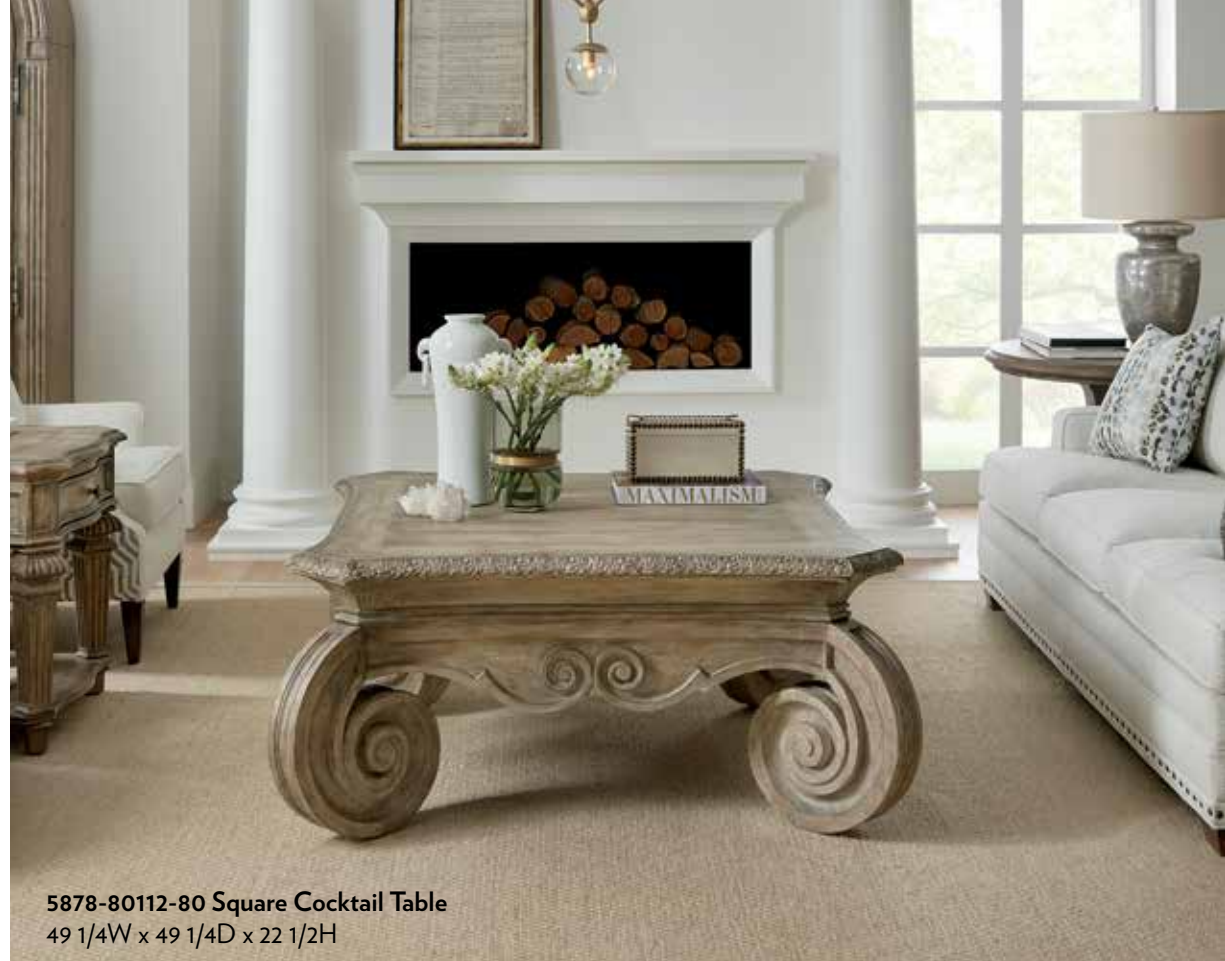
5878-80112-80 Square Cocktail Table 49 1/4W x 49 1/4D x 22 1/2H