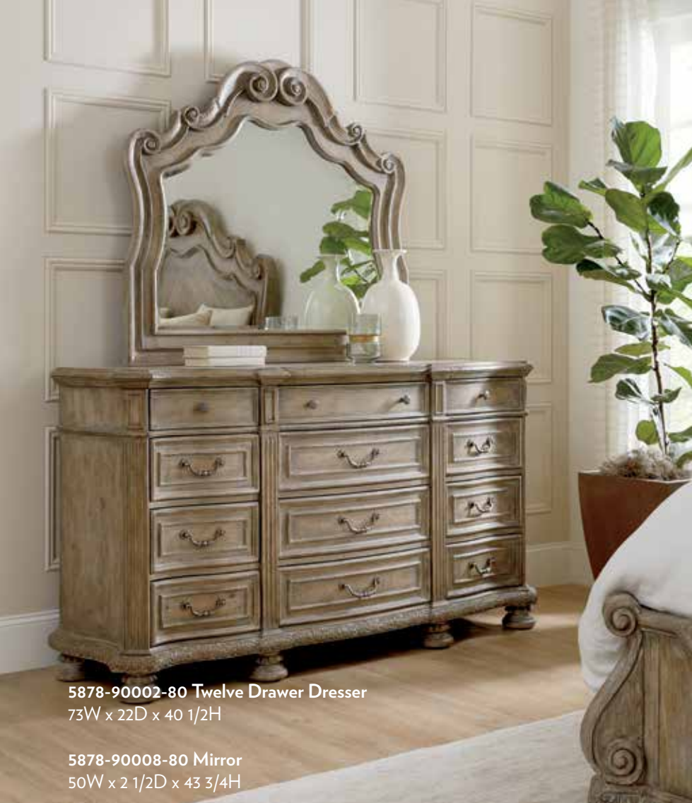
5878-90002-80 Twelve Drawer Dresser 73W x 22D x 40 1/2H