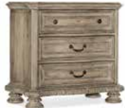
5878-90016-80 Three Drawer Nightstand Pecan, Quartered Walnut, Quartered Black Walnut, Quartered Ash and Maple Veneers, Cedar Drawer Bottom, Resin, Light, Outlet and Felt Panel; Antique Slate finish; Three drawers, top drawer has a removable felt liner, bottom drawer is cedar-lined, FC707 three-plug electrical outlet on the back, light underneath with three-intensity touch switch, levelers, anti-tip hardware 34 1/2W x 20 1/4D x 32 1/4H (88 x 52 x 82 cm) shown on page: 11