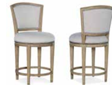
5878-75450-80 Upholstered Counter Stool Fabric: Natural Tan (Performance); Nailheads and Copper Sheet; Antique Slate finish; Copper plate on the footrest, memory swivel 21W x 24D x 40H (54 x 61 x 102 cm)