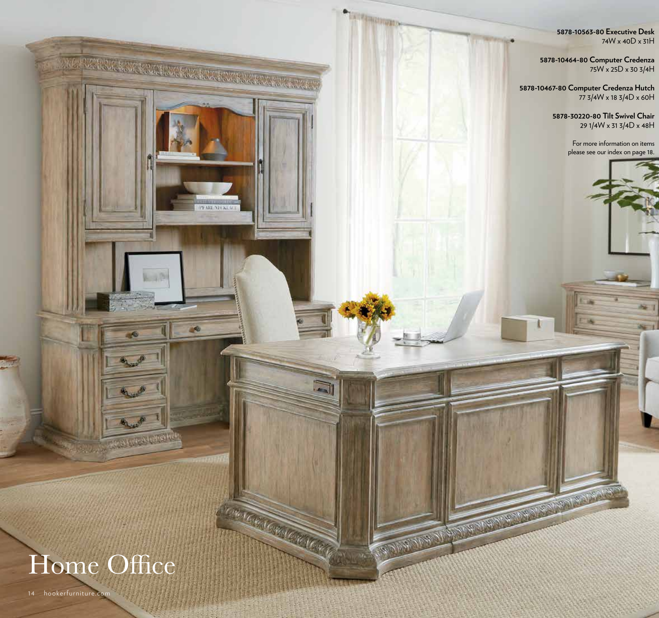
5878-10563-80 Executive Desk 74W x 40D x 31H