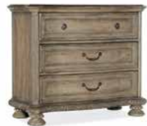
5878-90017-80 Bachelors Chest Pecan, Quartered Walnut, Quartered Black Walnut, Quartered Ash and Maple Veneers, Cedar Drawer Bottom, Felt Panel, Light and Outlet; Antique Slate finish; Three drawers, removable felt liner in top drawer, bottom drawer is cedar-lined, FC707 three-plug electrical outlet on the back, light underneath with three-intensity touch switch, levelers, anti-tip hardware 42W x 20D x 36 1/4H (107 x 51 x 93 cm) shown on page: 6, 9