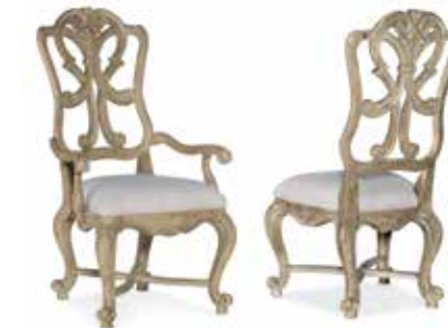
5878-75401-80 Wood Back Arm Chair Fabric: Natural Tan (Performance) Antique Slate finish; 26 1/2W x 28D x 46H (68 x 72 x 117 cm)