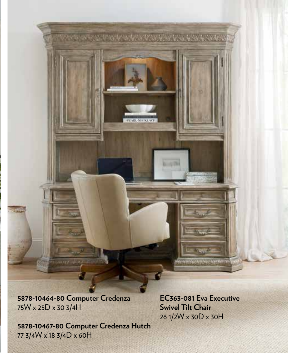
5878-10464-80 Computer Credenza 75W x 25D x 30 3/4H