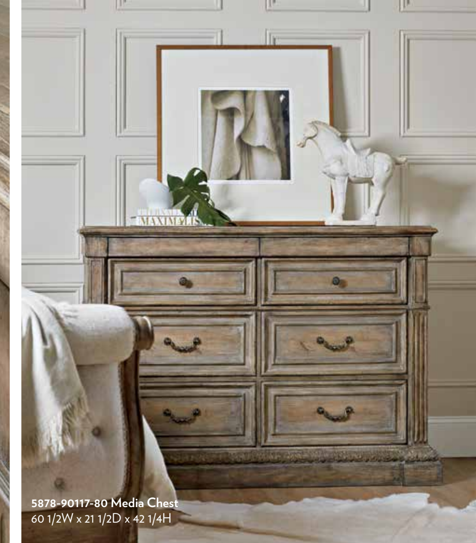
5878-90117-80 Media Chest 60 1/2W x 21 1/2D x 42 1/4H