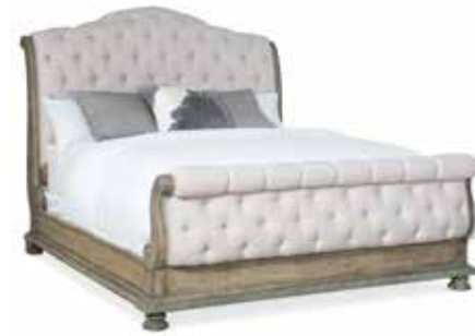
Tufted Bed Pecan Veneers; Antique Slate finish Fabric: Natural Tan (Performance)