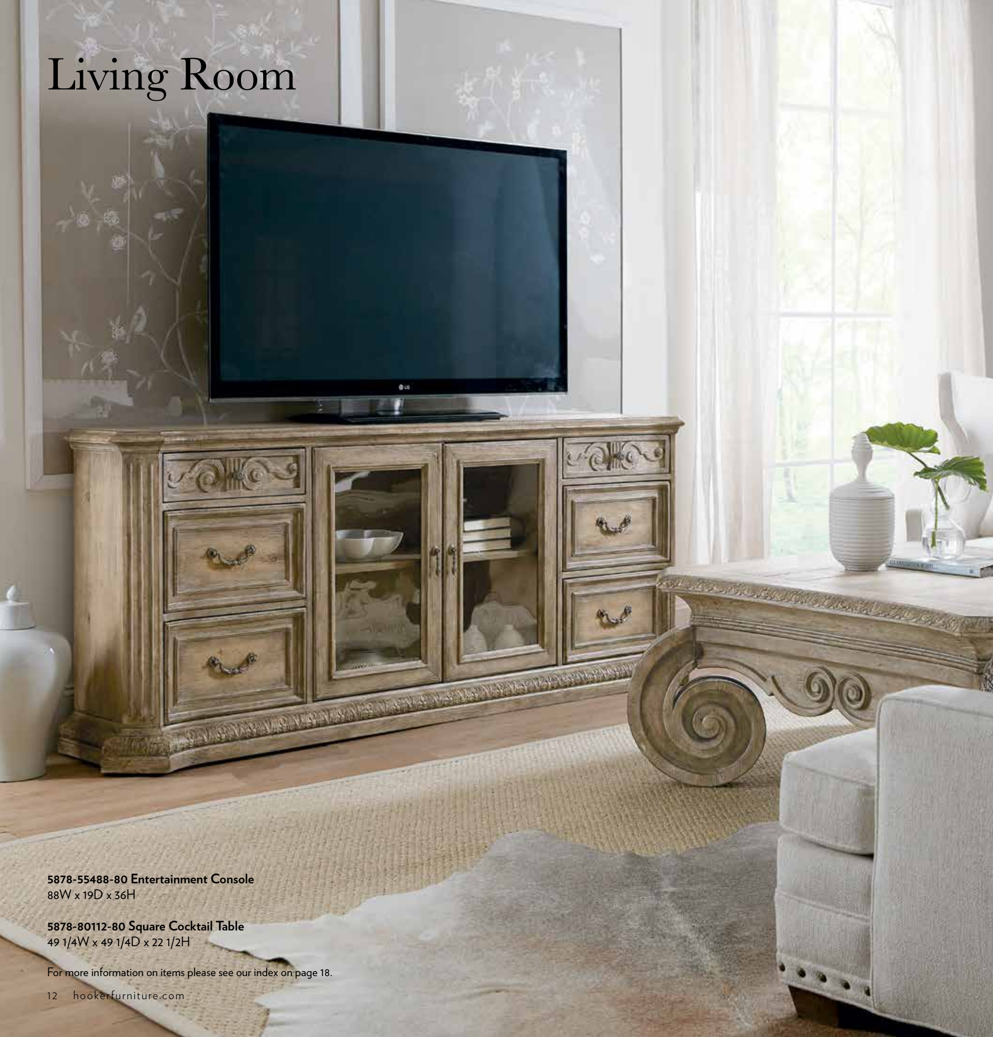
5878-55488-80 Entertainment Console 88W x 19D x 36H