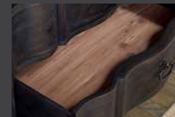
Detail of cedar-lined bottom drawer