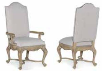
5878-75500-80 Upholstered Arm Chair Fabric: Natural Tan (Performance) and Nailheads; Antique Slate finish 26 3/4W x 30D x 48 3/4H (68 x 77 x 124 cm)