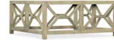
6015-80111-80 Square Cocktail Table Hardwoods and Stone Veneers Driftwood finish, levelers 42W x 42D x 18 1/4H (107 x 107 x 47 cm)