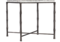
6015-80114-00 Rectangle End Table Selenite and Metal 24 1/2W x 26 1/2D x 25 3/4H (63 x 68 x 66 cm)