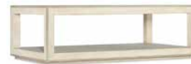
6120-80110-80 Rectangle Cocktail Table Oak Veneers and Burlap Terrain and Pebble Beach finishes Casters 52W x 30D x 17 1/2H (133 x 77 x 45 cm)