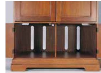
Audio compartments feature back ventilation holes to enhance air circulation and reduce heat build-up during use.