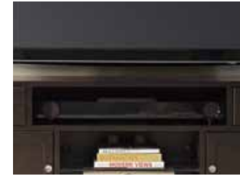
Many consoles feature a component area large enough for sound bars.