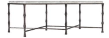
6015-80110-00 Rectangle Coffee Table Selenite and Metal 52W x 28D x 18 1/4H (133 x 72 x 47 cm)