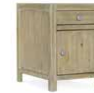
6015-50006-80 Chairside Chest Pecan Veneers with Solid-Wood Edged Top Driftwood finish One door with soft-close hinges, one adjustable shelf behind the door, one drawer with self-closing drawer guides, levelers, finished back 18W x 24D x 25H (46 x 61 x 64 cm)