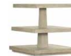
6120-80116-80 End Table Burlap Terrain and Pebble Beach finishes Three tiers, levelers 24W x 24D x 24H (61 x 61 x 61 cm)