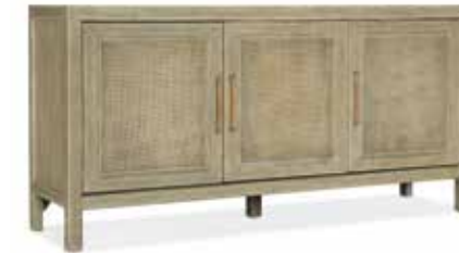
6015-55465-80 Small Media Console Pecan Veneers, Rattan, Solid-Wood Edge Top Driftwood finish Three rattan-front doors with soft-close hinges, one vented adjustable shelf behind left pair of doors, one vented adjustable shelf behind right door, ventilated back panel, one three plug electrical outlet, levelers 64 1/2W x 18D x 32 1/4H (164 x 46 x 82 cm)