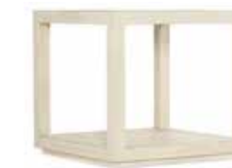
6120-80117-05 End Table Burlap and Metal Inlay Pebble Beach finish Metal inlay on top and bottom shelf, levelers 26W x 26D x 24H (67 x 67 x 61 cm)