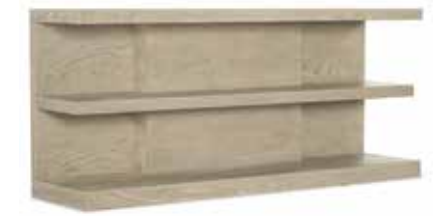
6120-85002-80 Console Table Oak Veneers Terrain finish One fixed shelf, levelers 60W x 14D x 30H (153 x 36 x 77 cm)