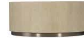
6120-80310-80 Cocktail Table Oak Veneers and Metal Terrain finish Casters, matched veneer on top 42 Dia. x 17H (107 x 44 cm)