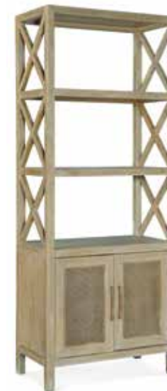
6015-55443-80 Entertainment Pier Pecan Veneers, Rattan Driftwood finish Two rattan-front doors with soft-close hinges, one adjustable vented shelf behind doors, two fixed shelves, levelers, designed to bunch with coordinating the Surfrider 6015-55465-80 entertainment console to create a full entertainment wall, it can also be used alone 34W x 18D x 86H (87 x 46 x 219 cm)