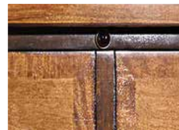
An infrared eye connects components to remote controls when components are hidden behind wood doors.