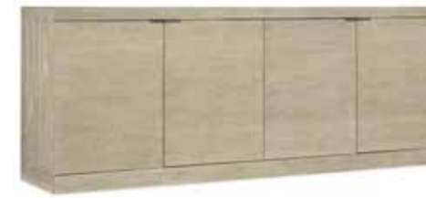
6120-55476-80 Credenza Oak Veneers Terrain finish Four doors with soft-close hinges, one adjustable shelf behind each pair of doors, ventilated back panel, one FC705 three-plug electrical outlet, levelers 76W x 17 1/2D x 30H (194 x 45 x 77 cm)