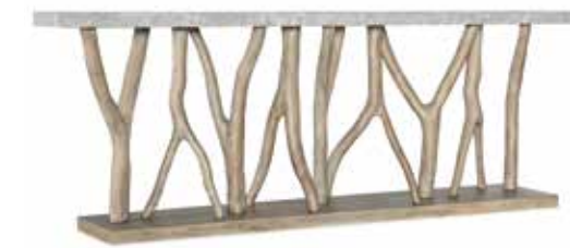
6015-85001-80 Console Table Pecan Veneers with Stone Veneer and Resin Driftwood finish 90W x 16D x 32 1/4H (229 x 41 x 82 cm)