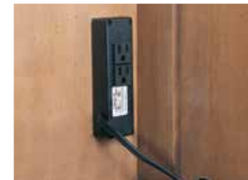
Multiple UL listed electrical outlets make equipment hookups easy.