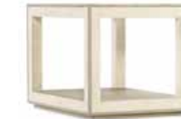
6120-80115-80 End Table Oak Veneers and Burlap Terrain and Pebble Beach finishes Levelers 30W x 22D x 22H (77 x 56 x 56 cm)