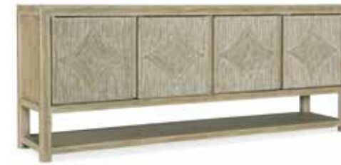
6015-55480-80 Entertainment Console Pecan Veneers, Resin and Solid-Wood Edge Top Driftwood finish Four diamond motif resin front doors with soft-close hinges and touch latches, one adjustable vented wood shelf behind each pair of doors, ventilated back panel, one three-plug electrical outlet, levelers 80W x 18D x 32H (204 x 46 x 82 cm)