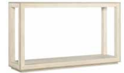
6120-85001-80 Console Table Oak Veneers and Burlap Terrain and Pebble Beach finishes Levelers, finished on all sides 58W x 15D x 34H (148 x 39 x 87 cm)