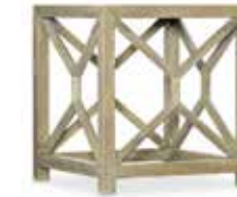
6015-80113-80 Square End Table Hardwoods and Stone Veneers Driftwood finish, levelers 22W x 22D x 24 1/4H (56 x 56 x 62 cm)