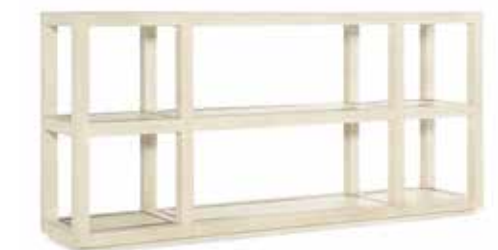
6120-85003-05 Console Table Burlap and Metal Inlay Pebble Beach finish One fixed shelf, levelers, finished on all sides 76W x 16D x 36H (194 x 41 x 92 cm)

The Cascade collection also offers matching bedroom, dining room, accents, and office items.