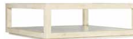
6120-80112-05 Square Cocktail Table Burlap, Tempered Glass and Mirror Pebble Beach finish Champagne colored metal trim around top, tempered glass top, mirrored bottom, casters 52W x 52D x 17H (133 x 133 x 44 cm)