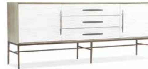
6120-55480-05 Entertainment Console Oak Veneers, Cast Resin Drawer and Door Fronts and Metal Terrain and Chalk finishes Two doors with soft-close hinges, three drawers, one adjustable shelf behind each door, ventilated back panel, one FC705 three-plug electrical outlet, levelers 80W x 18D x 32H (204 x 46 x 82 cm)