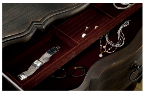
Detail of felt lined drawer