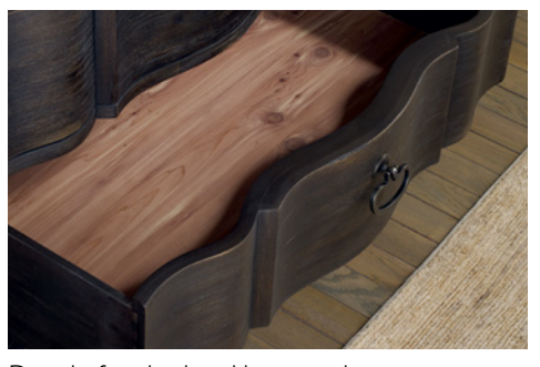
Detail of cedar-lined bottom drawer