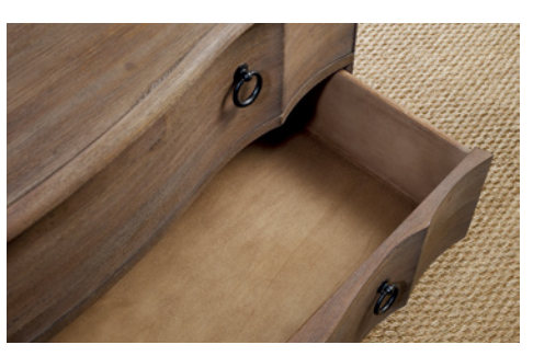
Drawer finished on bottom and sides