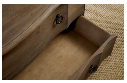
Drawer finished on bottom and sides