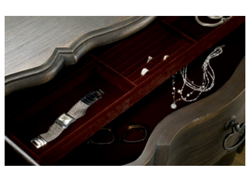
Detail of felt lined drawer