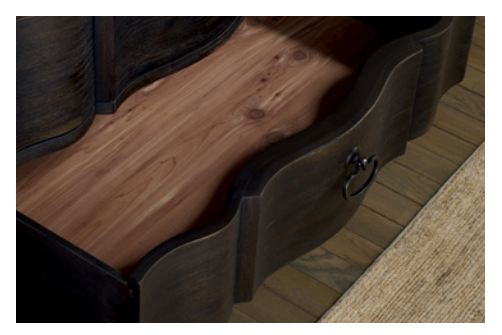
Detail of cedar-lined bottom drawer