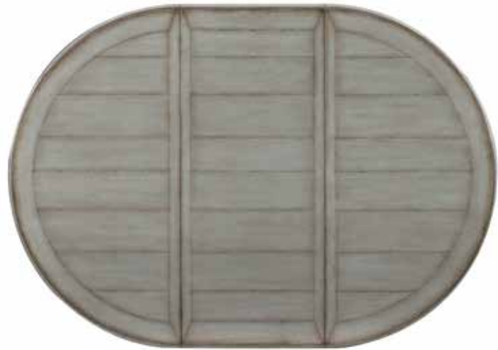
Top View of 1610-75203-WH 48-Inch Round Leg Table with One 20-Inch Leaf extends to 68-Inch