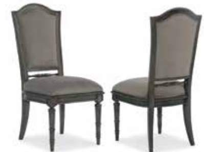
1610-75410-GRY Upholstered Back Side Chair Fabric: Deep Fog 20W x 26D x 44 1/4H (51 x 66 x 112 cm) shown on page 4