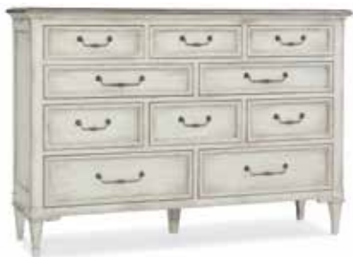
1610-90002-WH Ten-Drawer Dresser Maple Veneers, Aluminum, Cedar and Resin; Ten drawers, top left drawer has drop front, top left and right drawers have drop-in felt liner, top center drawer has removable felt jewelry tray, two bottom drawers are cedar lined 64W x 19D x 44 1/4H (163 x 48 x 112 cm) shown on page