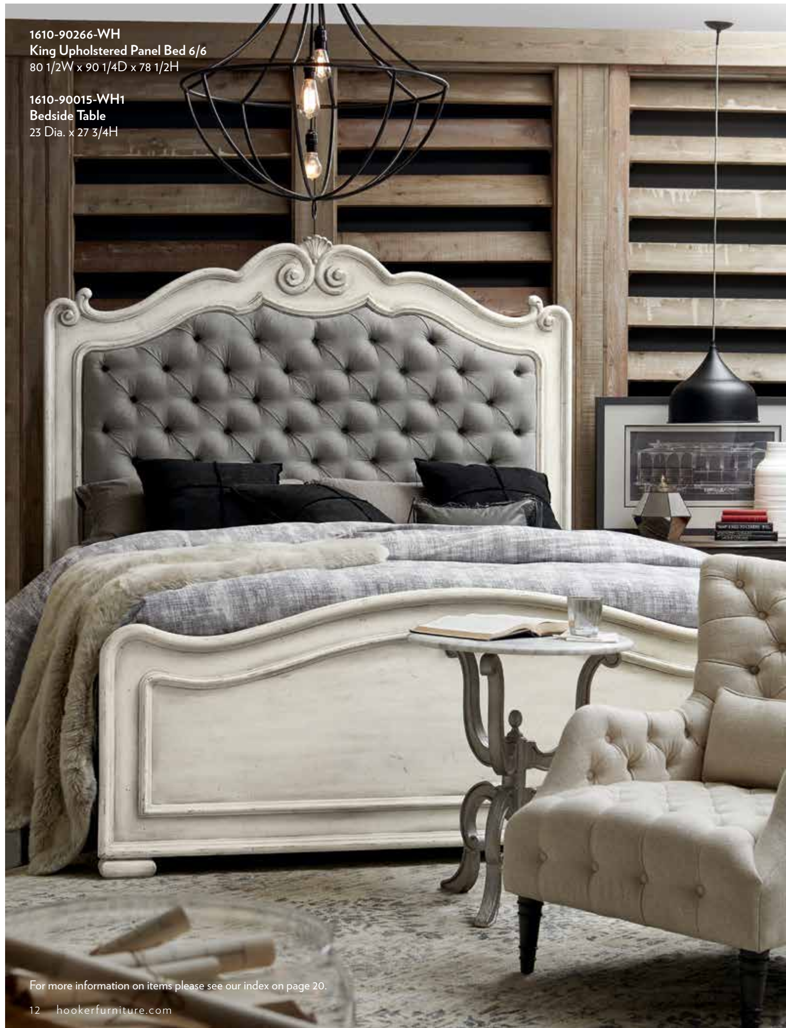
1610-90015-WH1 Bedside Table 23 Dia. x 27 3/4H