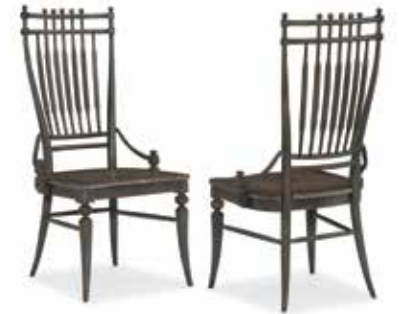
1610-75310A-GRY Windsor Side Chair Hardwoods 22 3/4W x 23 1/2D x 44H (58 x 60 x 112 cm) shown on page 5