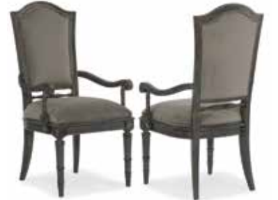
1610-75400-GRY Upholstered Back Arm Chair Fabric: Deep Fog 23 1/4W x 26D x 44 1/4H (59 x 66 x 112 cm)