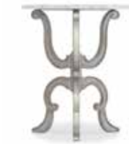
1610-90015-WH1 Bedside Table Metal and Marble 23 Dia. x 27 3/4H (58 x 70 cm) shown on page 12, 13