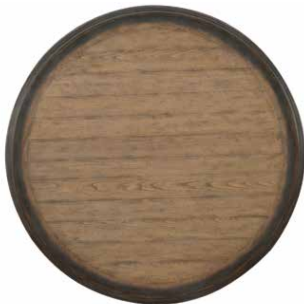
Top View of 1610-75211-GRY 72-Inch Round Pedestal Dining Table