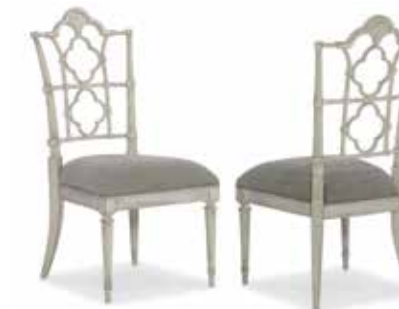
1610-75510-WH Side Dining Chair Maple Veneers and Fabric: Castle 20W x 23D x 41H (51 x 58 x 104 cm) shown on page 6