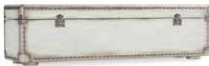
1610-90019-WH Storage Bench Maple Veneer with Aluminum and Nails; Metal wrapped edges 60W x 17D x 17H (152 x 43 x 43 cm) shown on page 11