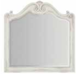
1610-90004-WH Mirror Maple Veneers with Resin and Mirror 42 1/4W x 2D x 42 1/4H (107 x 5 x 107 cm) shown on page 10