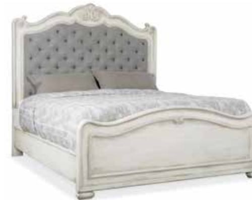
Upholstered Panel Bed Maple Veneers, Resin and Fabric; Castle; Available as headboard only.