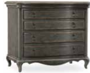
1610-10466-GRY Lateral File Oak, Ash and Ebony Veneers; One locking file drawer with Pendaflex letter/legal filing system, two utility drawers 37 1/2W x 22D x 32 1/4H (95 x 56 x 82 cm) shown on page 17