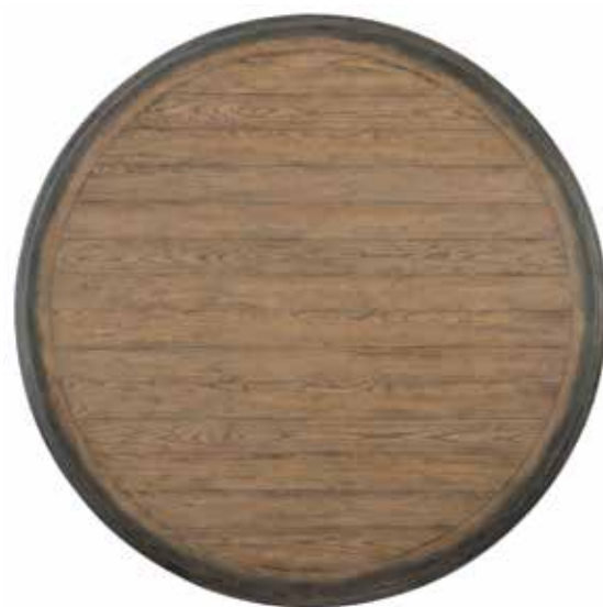
Top View of 1610-75201-GRY 60-Inch Round Pedestal Dining Table