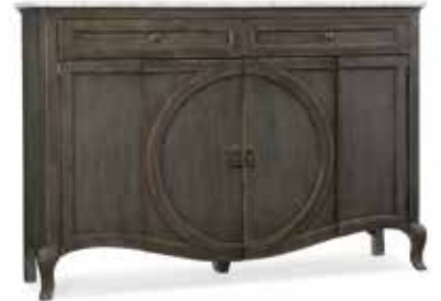
1610-85005-GRY Four-Door Two-Drawer Credenza Oak Veneers and Marble; Four doors, left and right outside doors have one adjustable shelf and touch latch for opening, center doors have two adjustable shelves, two drawers, ventilated back panel 62W x 16D x 42 1/2H (157 x 41 x 108 cm) shown on page 3