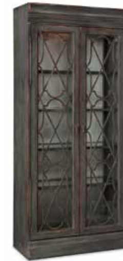
1610-75906A-GRY Bunching Display Cabinet Hardwoods with Seeded Glass and Glass; Two doors with seeded glass and wood fretwork, three adjustable wood framed glass shelves, one fixed wood framed glass shelf, reversible back panel with one side painted faux eglomise and the other side is finished the same as case, one light with three-intensity touch switch 38W x 17 1/4D x 84H (97 x 44 x 213 cm) shown on page 5