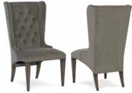
1610-35001-GRY Upholstered Host Chair Fabric: Deep Fog 24 1/2W x 28 1/2D x 45 1/2H (62 x 72 x 116 cm) shown on page 4, 16