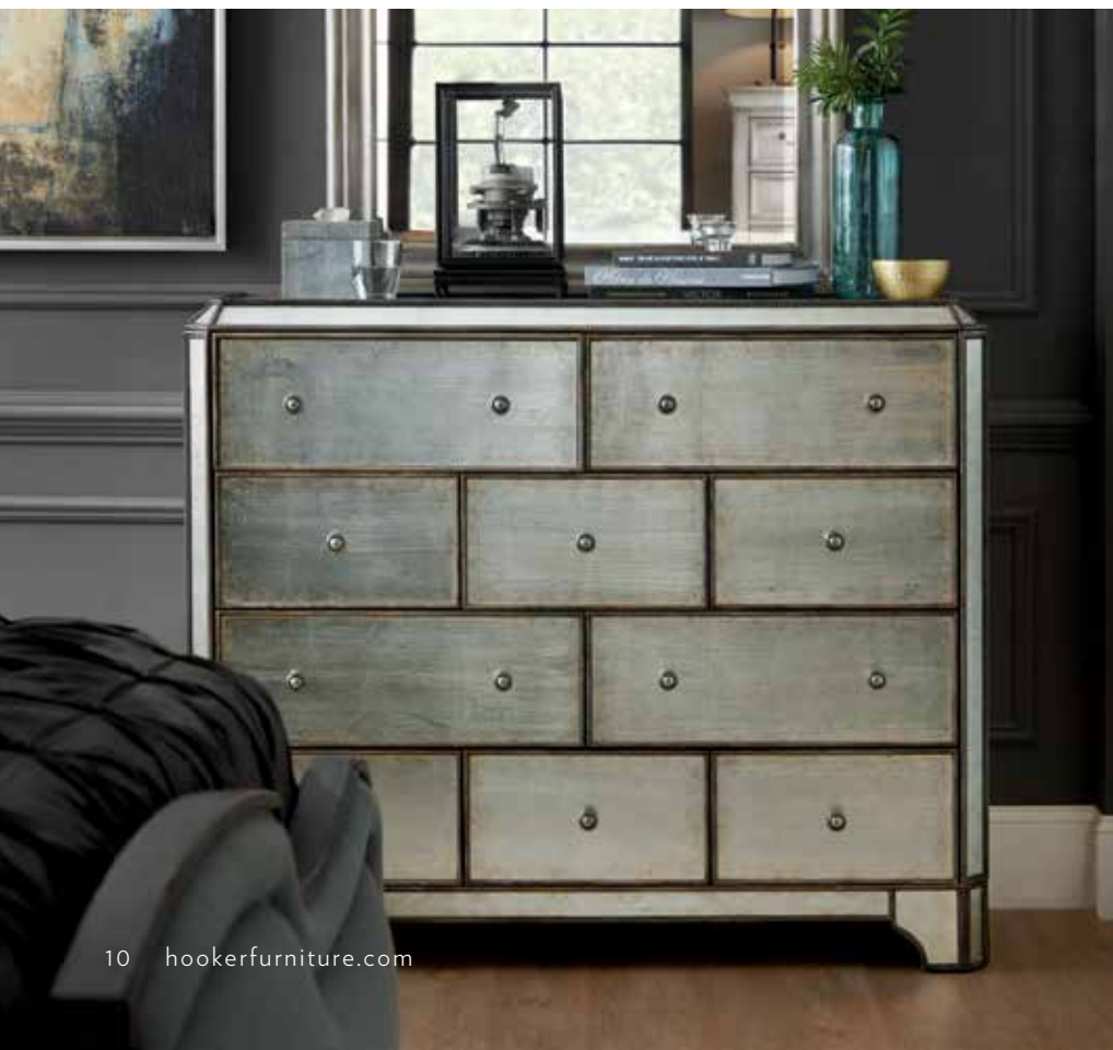
1610-90011-EGLO Ten-Drawer Bureau 52 1/2W x 20 1/4D x 44H

For more information on items please see our index on page 20.