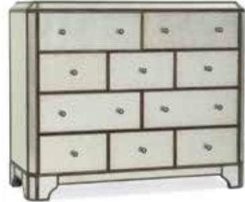
1610-90011-EGLO Ten-Drawer Bureau Hardwoods, Cedar and Eglomise; Ten drawers, top left drawer has a drop front and drop in felt liner, top right drawer has a removable felt lined jewelry tray, three bottom drawers are cedar lined 52 1/2W x 20 1/4D x 44H (133 x 51 x 112 cm) shown on page 10