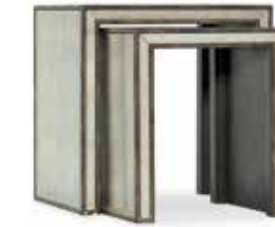
1610-50002-EGLO Nesting Tables Hardwoods and Eglomise Large Table: 24W x 18D x 24H (61 x 46 x 61 cm) Small Table: 18 1/2W x 18D x 21 1/2H (47 x 46 x 55 cm) shown on page 15