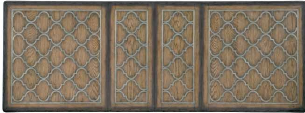
Top View of 1610-75207-MULTI Rectangle Leg Table with Two 20-Inch Leaves extends to 120-Inch