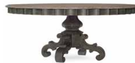
1610-75211-GRY 72-Inch Round Pedestal Dining Table Oak Veneer and Resin Will accommodate up to 8 side chairs 72 Dia. x 30 1/4H (183 x 77 cm)