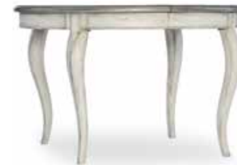
1610-75203-WH 48-Inch Round Leg Table with One 20-Inch Leaf Maple Veneer with Aluminum and Nails Will accommodate up to 8 side chairs with leaf in place 20" leaf will extend table to 68" (173 cm) long 48 Dia. x 30 1/4H (122 x 77 cm) shown on page 6