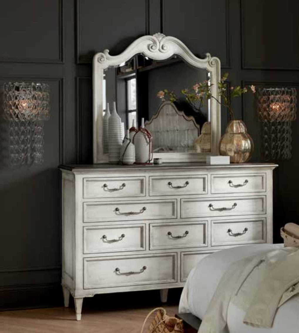
1610-90004-WH Mirror 42 1/4W x 2D x 42 1/4H