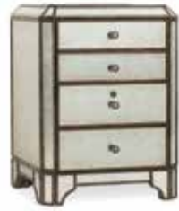
1610-10412-EGLO Mirrored Lateral File Hardwood with Eglomise One locking file drawer with Pendaflex letter/legal filing system, two utility drawers 22 1/2W x 21 1/4D x 30H (57 x 54 x 76 cm) shown on page 19