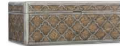
1610-50003-MULTI Trunk Cocktail Table Oak Veneers, Aluminum Sheet and Cedar; One storage tray with five compartments, casters, metal inlay 48W x 26 1/4D x 19 1/2H (122 x 67 x 50 cm) shown on page 15