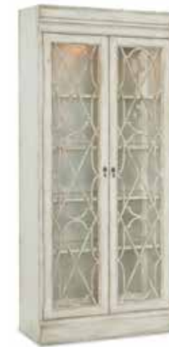
1610-75906-WH Bunching Display Cabinet Maple Veneers and Seeded Glass and Glass; Two doors with seeded glass and wood fretwork, three adjustable wood framed glass shelves, one fixed wood framed glass shelf, reversible back panel with one side painted faux eglomise and the other side is finished the same as case, one light with three-intensity touch switch 38W x 17 1/4D x 84H (97 x 44 x 213 cm) shown on page 6