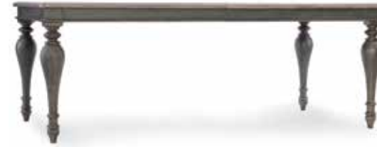
1610-75207-MULTI Rectangle Leg Table with Two 20-Inch Leaves Maple Veneer with Aluminum and Nails Will accommodate 2 arm chairs and 8 side chairs with both leaves in place Table extends to 120" (305 cm) with both leaves in place 80W x 44D x 30 1/2H (203 x 112 x 77 cm) shown on page 4, 5