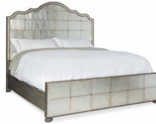
Mirrored Panel Bed Oak Veneers, Eglomise and Metal Button; Available as headboard only.