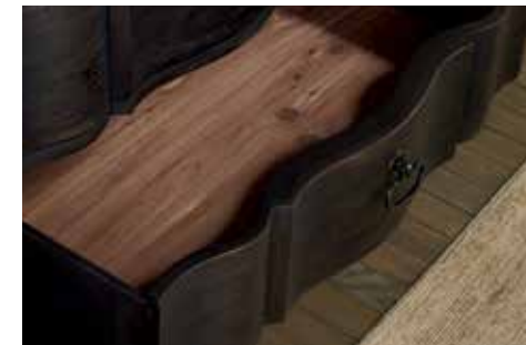
Detail of cedar-lined bottom drawer