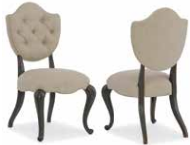
1610-35002-GRY Upholstered Side Chair Fabric: Pebble 21 1/4W x 24 3/4D x 40 1/2H (54 x 63 x 103 cm) shown on page 2, 18