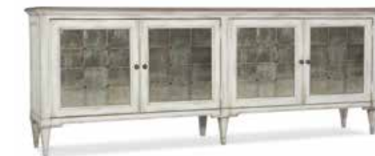
1610-85006-WH Four-Door Credenza Maple Veneers and Eglomise with Aluminum, Metal Buttons and Nails; Four doors with two shelves behind each set of doors, ventilated back panel 104W x 19D x 38 1/4H (264 x 48 x 97 cm) shown on page 15