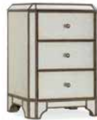
1610-90116-EGLO Mirrored Three-Drawer Nightstand Hardwoods, Cedar Veneers and Eglomise; Three drawers, top drawer has drop in felt liner, bottom drawer has cedar bottom, one live USB port and three electrical outlets, one touch switch located on each side of case, one light underneath, cord clip 22 1/2W x 19D x 32H (57 x 48 x 81 cm) shown on page 11