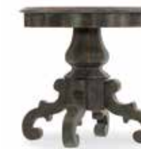
1610-50005-GRY Accent Table Oak Veneers and Resin 24Dia. x 24H (61 x 61 cm) shown on page 14