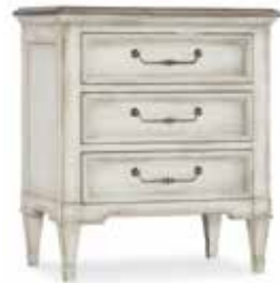
1610-90115-WH Three-Drawer Nightstand Maple Veneers, Cedar and Aluminum; Three drawers, top drawer has drop in felt liner, bottom drawer has cedar bottom, metal wrapped top, one live USB port and three electrical outlets, one touch switch located on each side of case, one light underneath, cord clip 29W x 18D x 32 1/4H (74 x 46 x 82 cm) shown on page 8, back cover