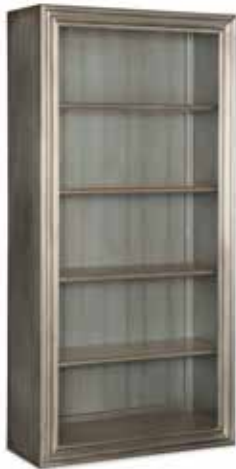
1610-10445-MTL Bunching Etagere Maple Veneers and Aluminum Three adjustable metal wrapped shelves, one metal wrapped fixed shelf (3rd shelf from the top) 38 3/4W x 15 3/4D x 80 1/4H (98 x 40 x 204 cm) shown on page 16