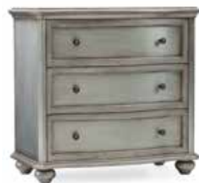
1610-90117-MTL Bachelor's Chest Hardwoods, Cedar Veneers, Aluminum and Nails; Three drawers, top drawer has drop in felt liner, bottom drawer has cedar bottom, one live USB port and three electrical outlets, one touch switch located on each side of case, one light underneath, cord clip, metal wrapped case and drawer fronts 36W x 19D x 34H (91 x 48 x 86 cm) shown on page 9, 11