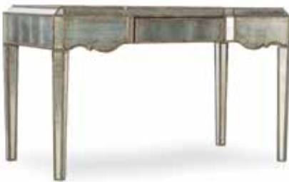
1610-10458-EGLO Mirrored Writing Desk Hardwood and Glass; Center drawer with drop front for keyboard use with cut out for wire management Keyboard drawer: 16W x 16 1/2-19 1/2D x 2 1/2H (42 x 42-50 x 6 cm) Kneespace: 43 1/4W x 22 1/2D (110 x 57 cm) shown on page 18