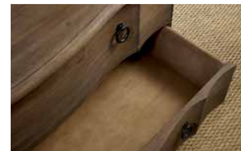
Drawer finished on bottom and sides