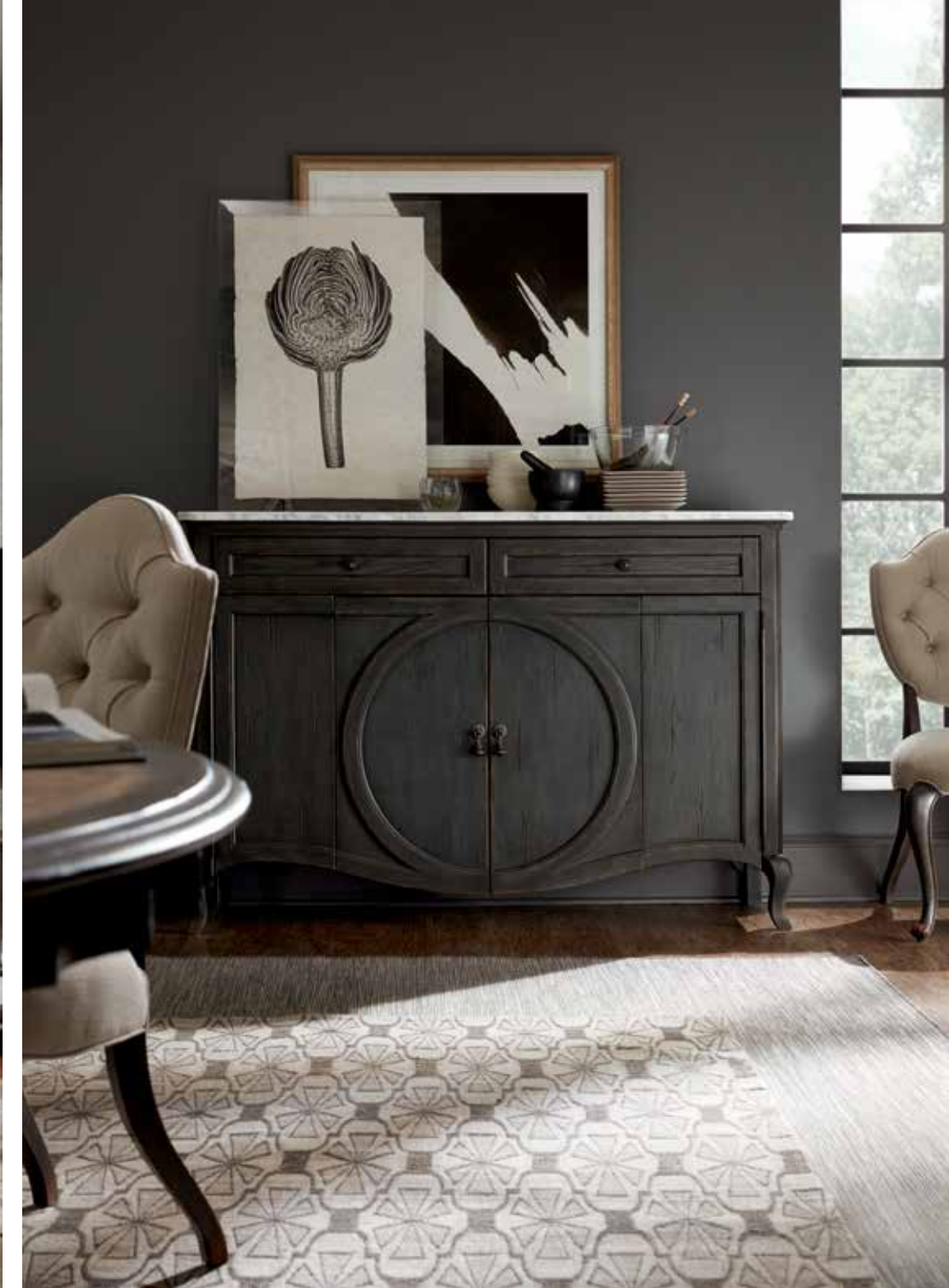
1610-75201-GRY 60-Inch Round Pedestal Dining Table 60 Dia. x 30 1/4H