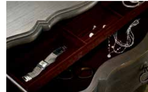
Detail of felt lined drawer