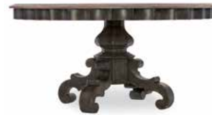
1610-75201-GRY 60-Inch Round Pedestal Dining Table Oak Veneer and Resin 60 Dia. x 30 1/4H (152 x 77 cm) Will accommodate up to 6 side chairs shown on page 2