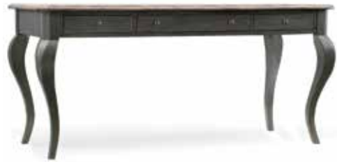
1610-10459-MULTI Leg Desk Oak Veneers and Aluminum Sheet Three drawers, center drawer with drop front for keyboard use with cut out for wire management, two utility drawers with one pencil tray and one drop in writing slide for use in either drawer, two removable dividers in each utility drawer Keyboard drawer: 23W x 14 1/2 - 17 1/4D x 2 1/2H (58 x 37-44 x 6 cm) 66W x 28D x 31H (168 x 71 x 79 cm) shown on page 16