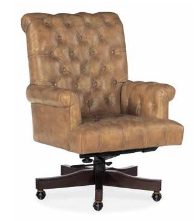
EC412-087 Braham Executive Swivel Tilt Chair Bedford Goldington (Handwipe) (Aniline Top Grain) 28 1/2W x 32 1/2D x 40 1/2 - 41 1/2H Seat Width: 18

Seated in style. Our desk chairs make your personal office look beautiful and feel even better. Design meets comfort in our chair styles.