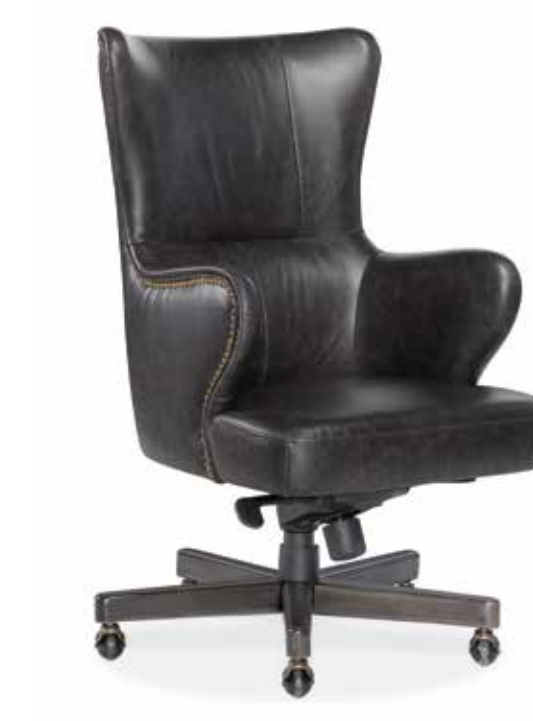
EC803-096 Amelia Executive Swivel Tilt Chair