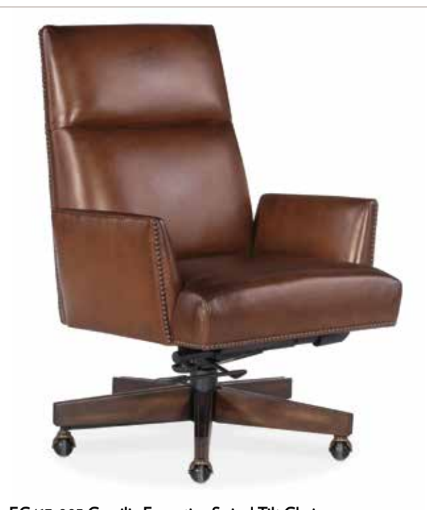
EC413-085 Gracilia Executive Swivel Tilt Chair

Seat Depth: 20 Seat Height: 19 - 20 Arm Height: 24 - 25