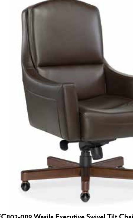
EC802-089 Wasila Executive Swivel Tilt Chair