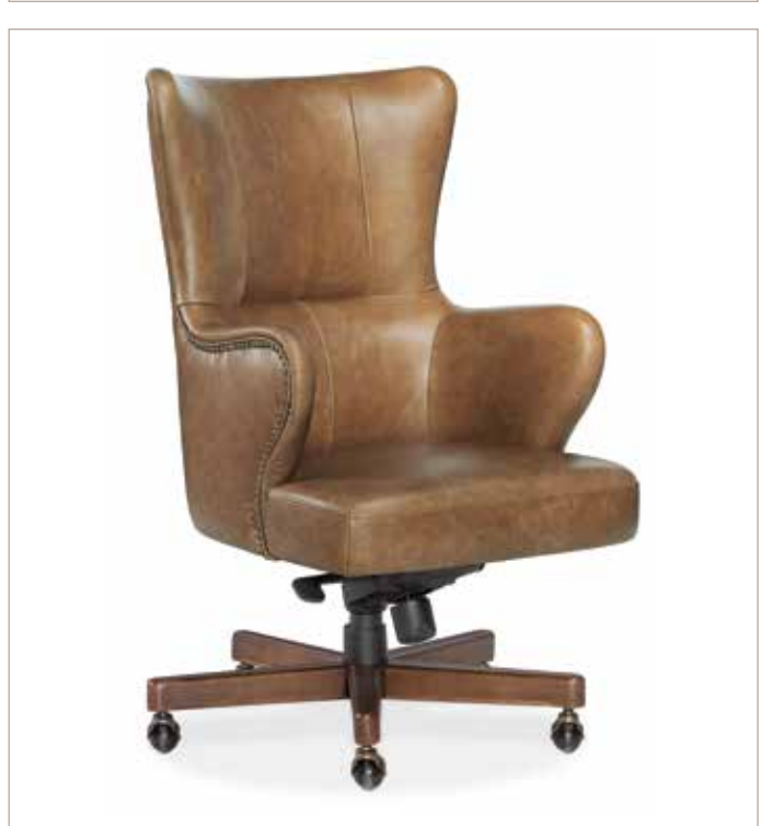
EC803-088 Amelia Executive Swivel Tilt Chair