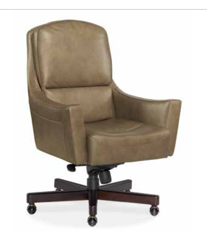
EC802-081 Wasila Executive Swivel Tilt Chair

Please visit our website, hookerfurniture.com to see matching pieces and our full line of home office product.